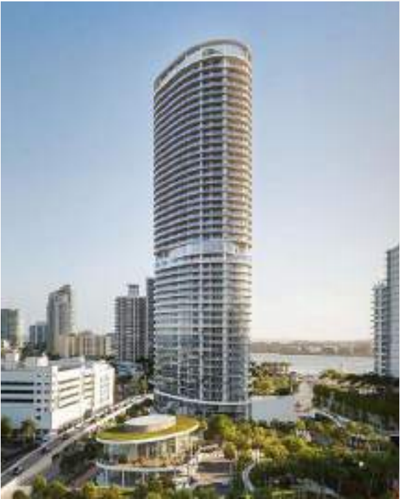
Arquitectonica Five Park, Miami Beach, FL