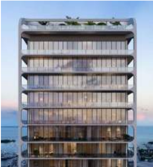
Meyer Davis Mr. C Residences, Coconut Grove, FL