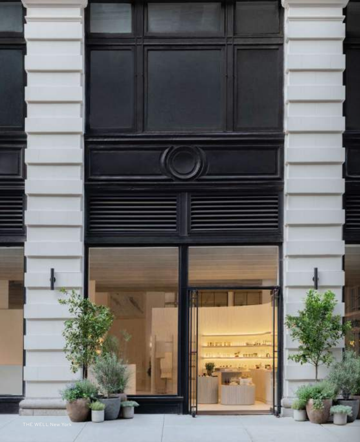
THE WELL New York