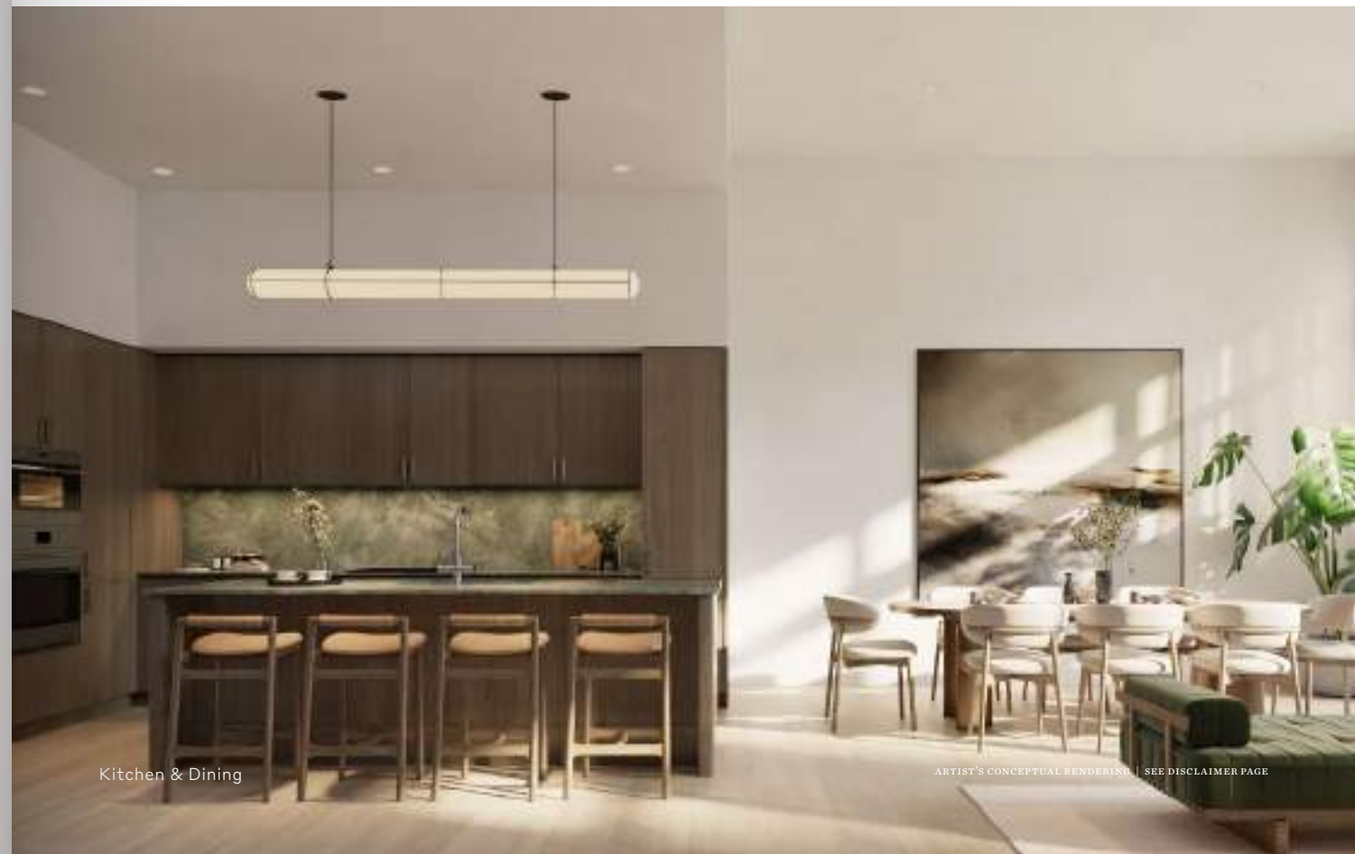
Kitchen & Dining

The kitchen is designed with a focus on holistic health and features the remarkable Kore™ Workstation Kitchen Sink, acclaimed for its sleek design and exceptional functionality. The quartzite countertops and backsplash provide a clean and fluid aesthetic. Throughout the kitchen, Sub-Zero and Wolf appliances are integrated for a modern touch. The faucet offers both still and carbonated water options, and each kitchen is equipped with a Vitamix blender and a custom air fryer.