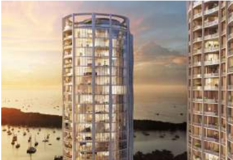
Terra Park Grove, Coconut Grove, FL