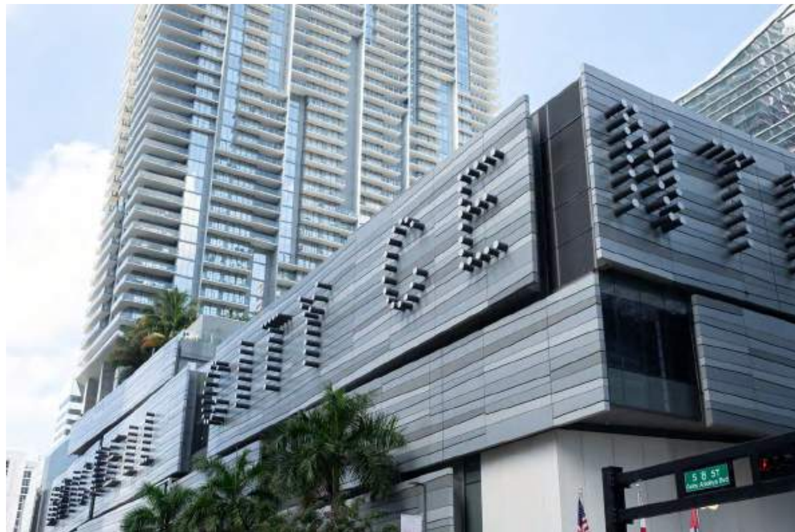
Left Page: Brickell City Centre