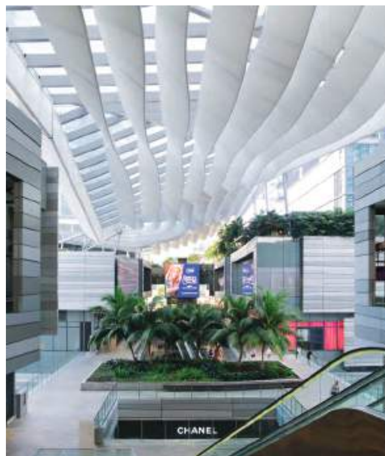
Right Page: Pérez Art Museum, Brickell Shopping, Cipriani Downtown Miami