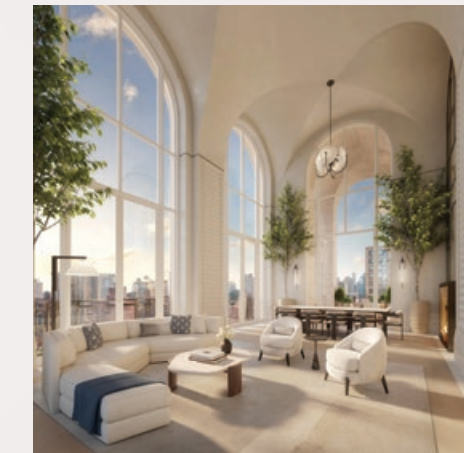
FOUR SEASONS, BOGOTÁ