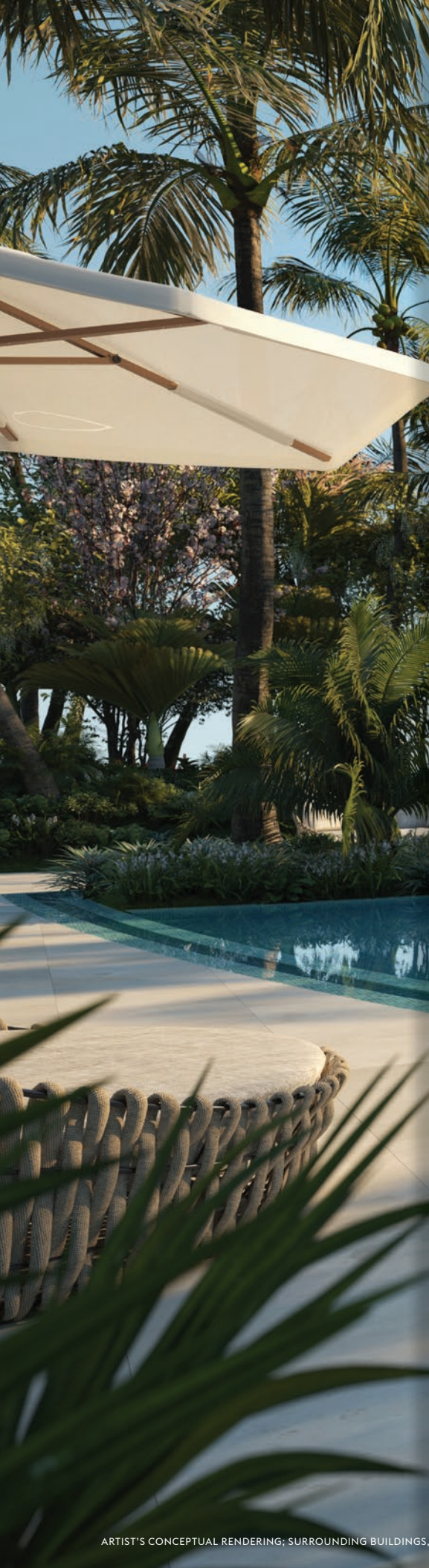
ARTIST'S CONCEPTUAL RENDERING; SURROUNDING BUILDINGS.