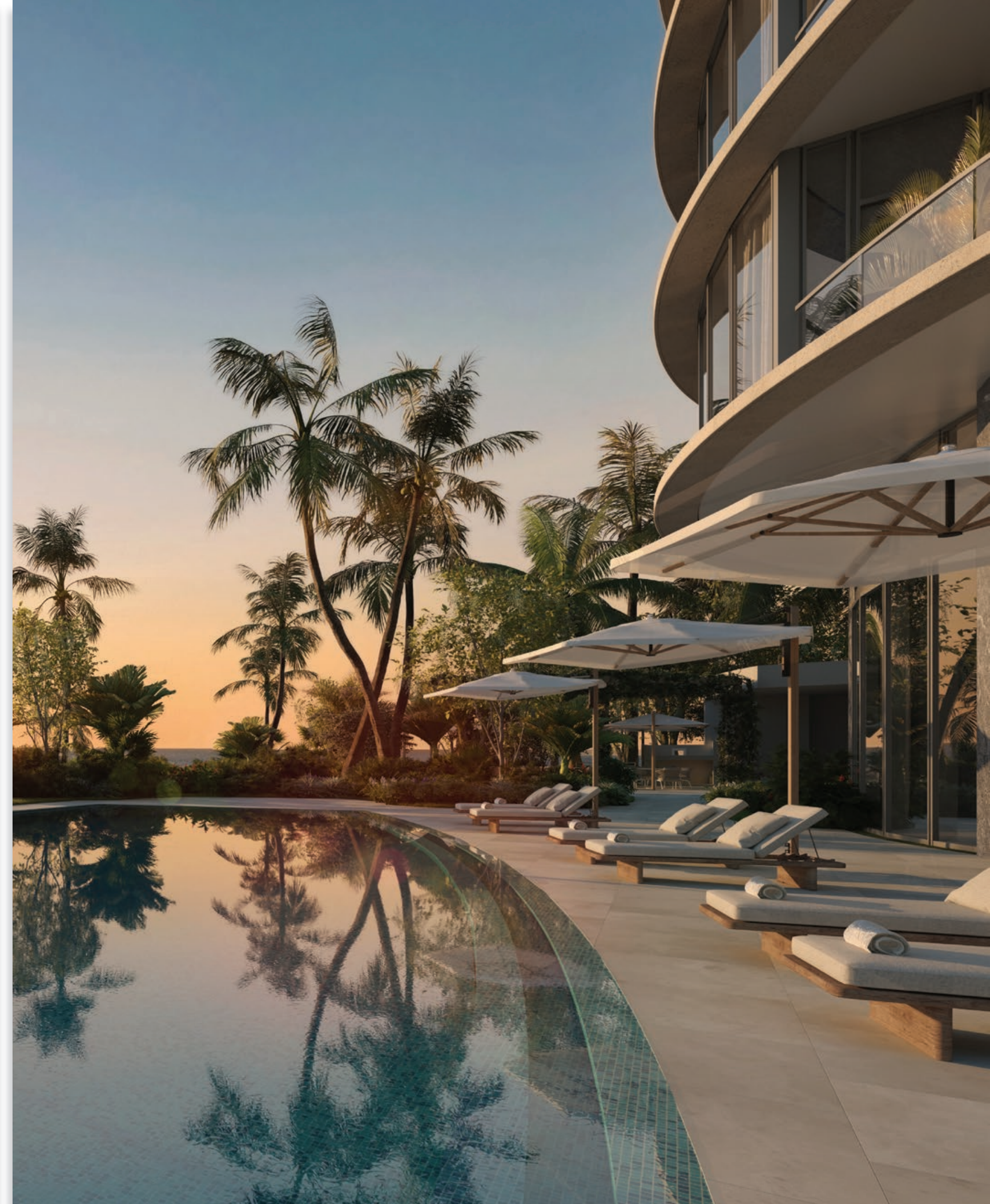
SUNRISE POOL & BEACH CLUB

ARTIST'S CONCEPTUAL RENDERING; SURROUNDING BUILDINGS, LANDSCAPES, AND LANDMARKS MODIFIED OR OMITTED.