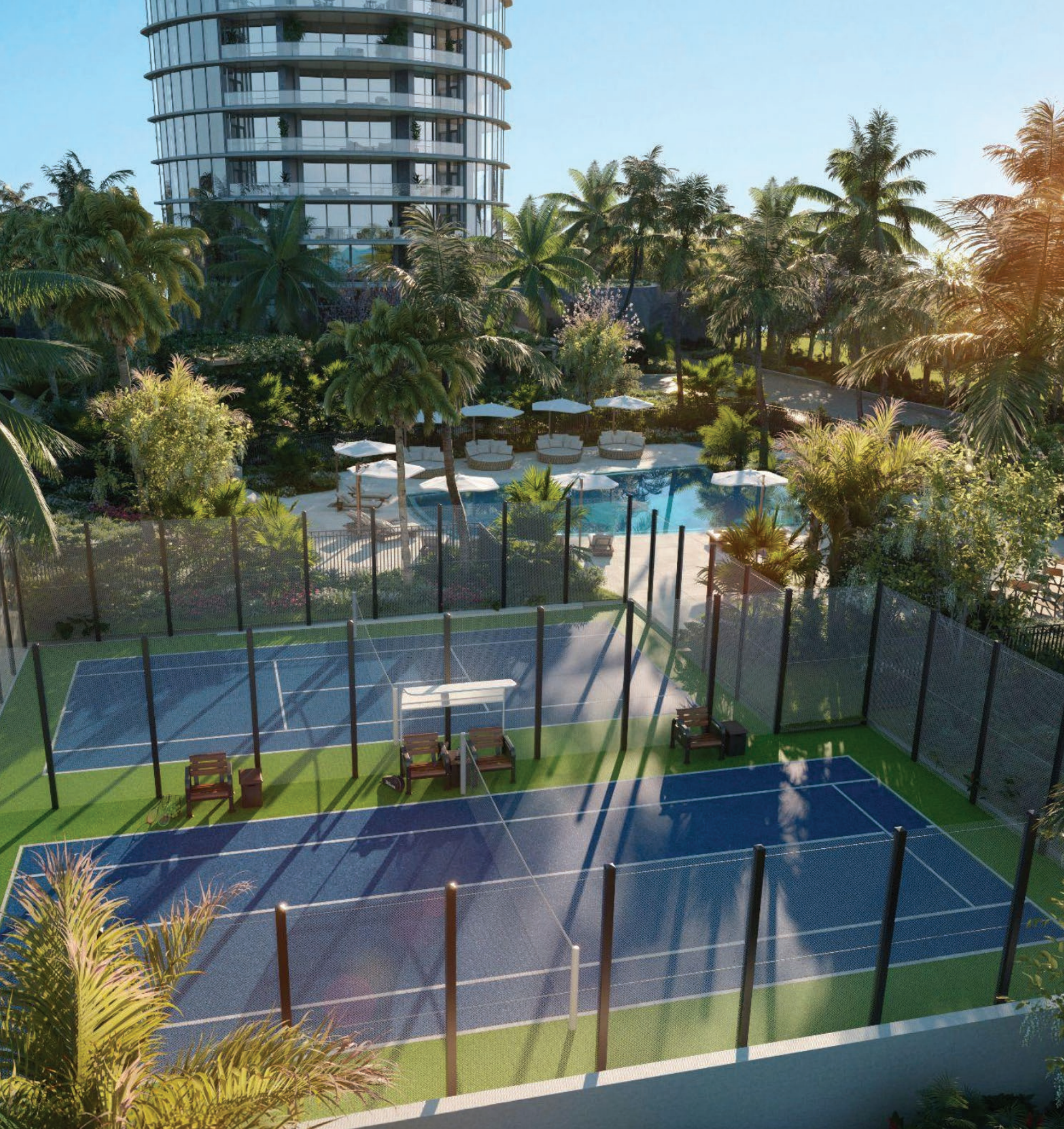
PICKLEBALL & PADEL COURTS, SUNSET POOL