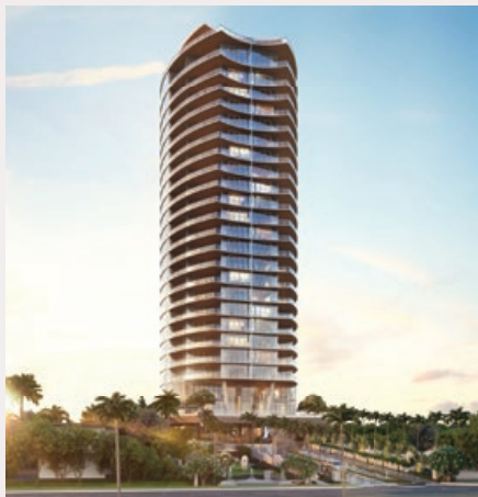
FORTÉ, WEST PALM BEACH

Established in 1979, Related Group is Florida’s leading developer of sophisticated metropolitan living and one of the country’s largest real estate conglomerates. Since its inception more than 40 years ago, the company has built, rehabilitated, and managed over 100,000 condominium, rental, and commercial units. The firm is one of the largest privately owned businesses in the United States with a development portfolio worth more than $40 billion. Currently, Related Group has 90+ projects in varying phases of development.