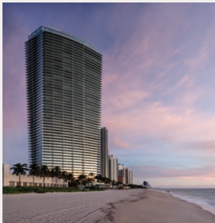
RESIDENCES BY ARMANI CASA, SUNNY ISLES