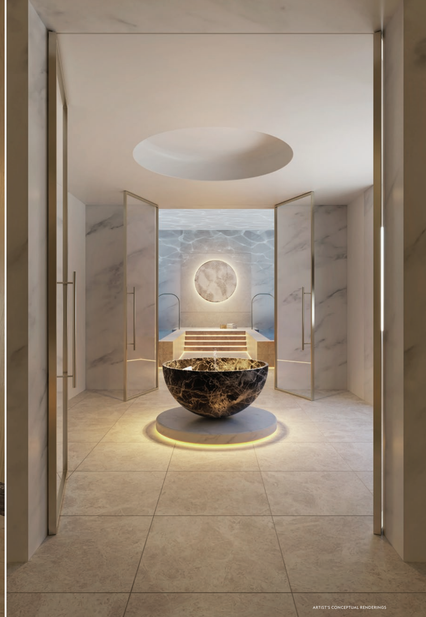
ARTIST'S CONCEPTUAL RENDERINGS