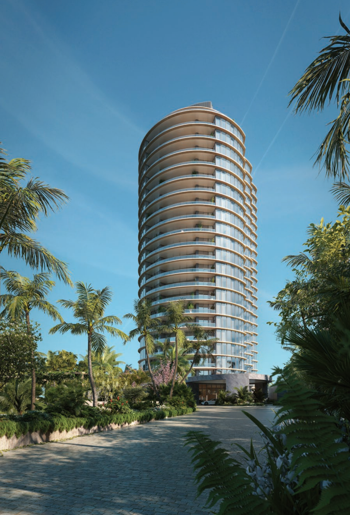
ARRIVAL FROM COLLINS AVENUE