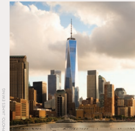
ONE WORLD TRADE CENTER, NEW YORK

Instrumental in bringing Miami’s most important new developments to market, the firm provides unparalleled expertise that is further complemented by real-time market intelligence from its skilled brokerage professionals.