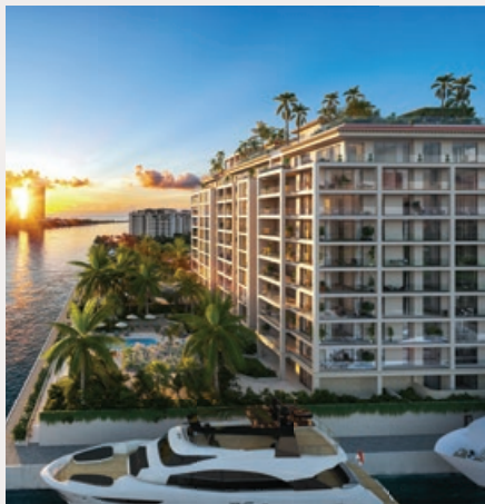
THE RESIDENCES AT SIX FISHER ISLAND, MIAMI

Two Roads Development is a South Florida-based real estate development firm whose principals have over 120 years of combined experience in developing, financing and marketing residential and commercial projects across the United States. The company’s visionary approach and unparalleled business acumen combine to create landmark projects in some of the nation’s most celebrated metropolitan areas.