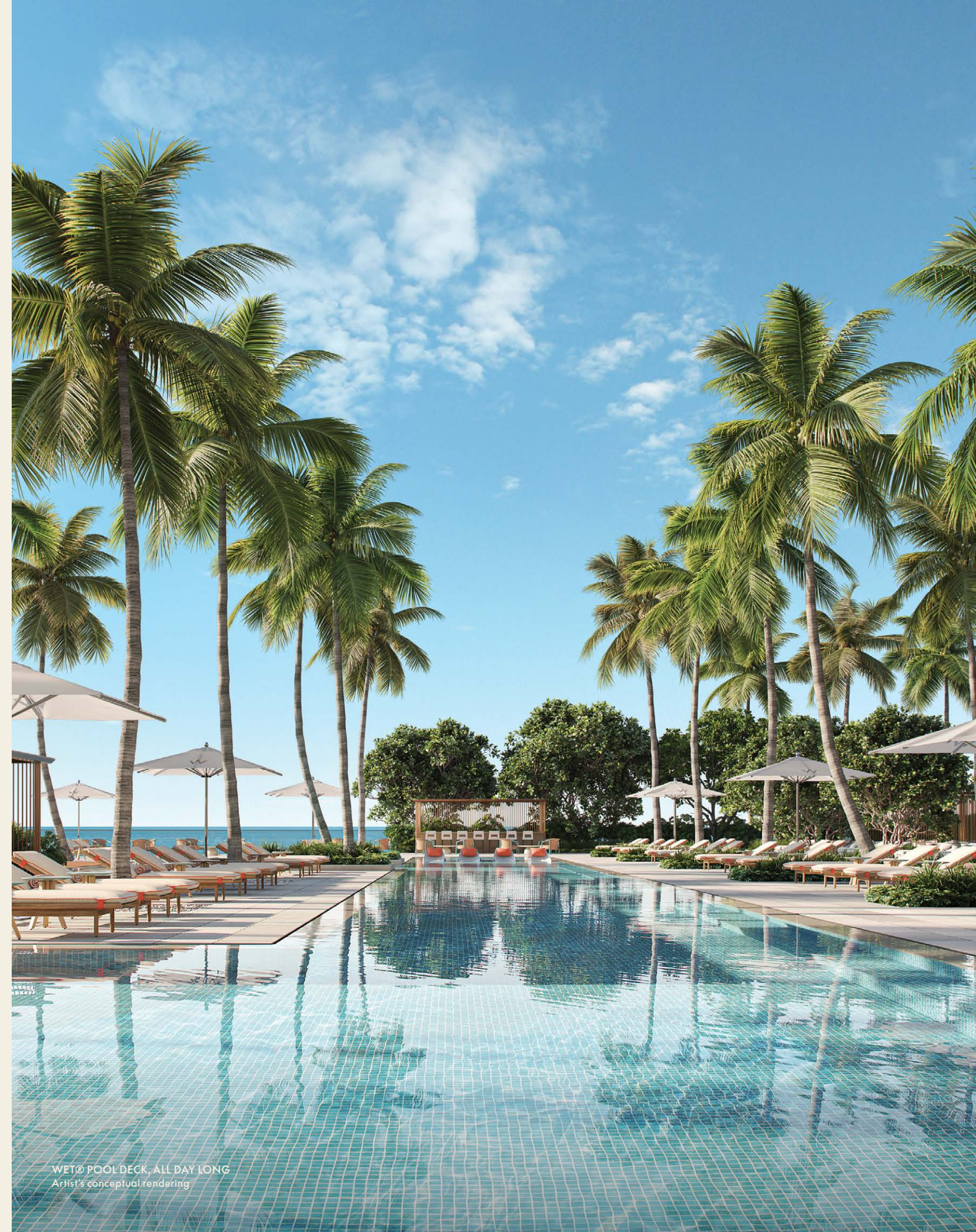
WET® POOL DECK, ALL DAY LONG Artist's conceptual rendering

Game lounge with F1 racing and world-class multisport simulator