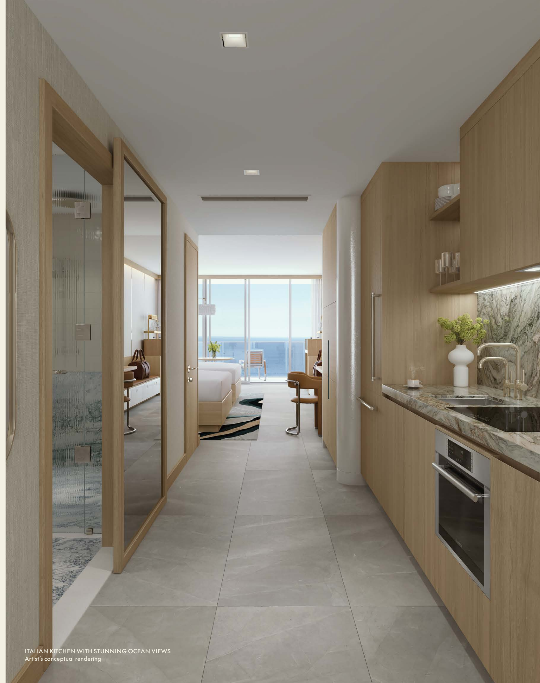
ITALIAN KITCHEN WITH STUNNING OCEAN VIEWS Artist's conceptual rendering