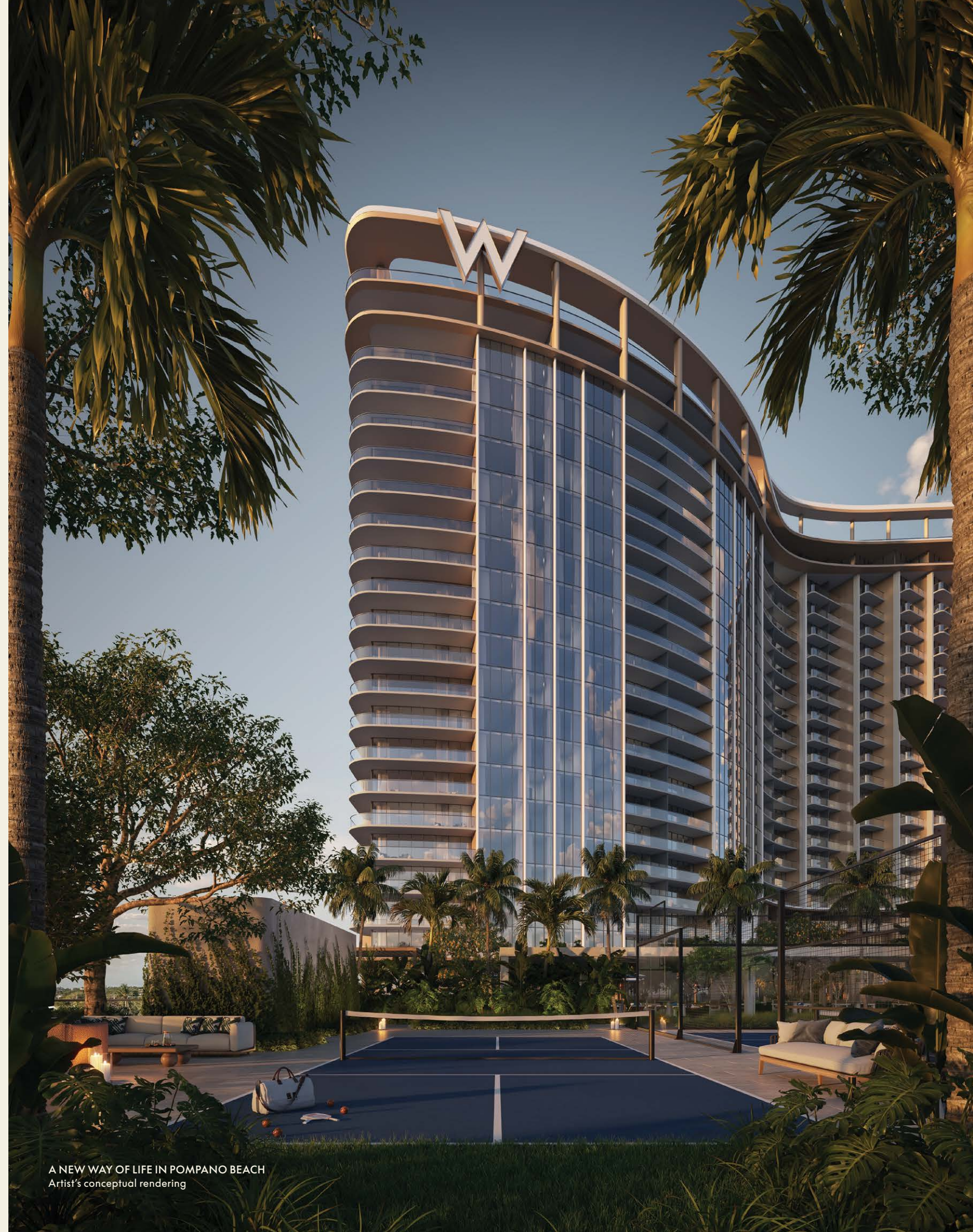
A NEW WAY OF LIFE IN POMPANO BEACH Artist's conceptual rendering

Founded by renowned Swiss landscape architect Enzo Enea, Enea Landscape Architecture is an internationally renowned firm known for creating extraordinary outdoor environments. Enea brings over three decades of experience in blending art, nature, and architecture to craft timeless landscapes. Enea's diverse portfolio includes private residences, urban parks, luxury developments, hospitality projects, and public spaces. Their designs feature meticulously curated outdoor spaces that seamlessly integrate with the architecture. They use native plants, sculptural elements, and creative architectural solutions, ensuring aesthetic appeal and sustainability, all while respecting the genius loci of Pompano Beach. Whether it's tranquil courtyards, lush rooftop gardens, or sophisticated pool areas, Enea Landscape Architecture creates serene and inviting spaces for residents and guests to enjoy. Their designs elevate the living experience, offering a harmonious connection between nature and the built environment.