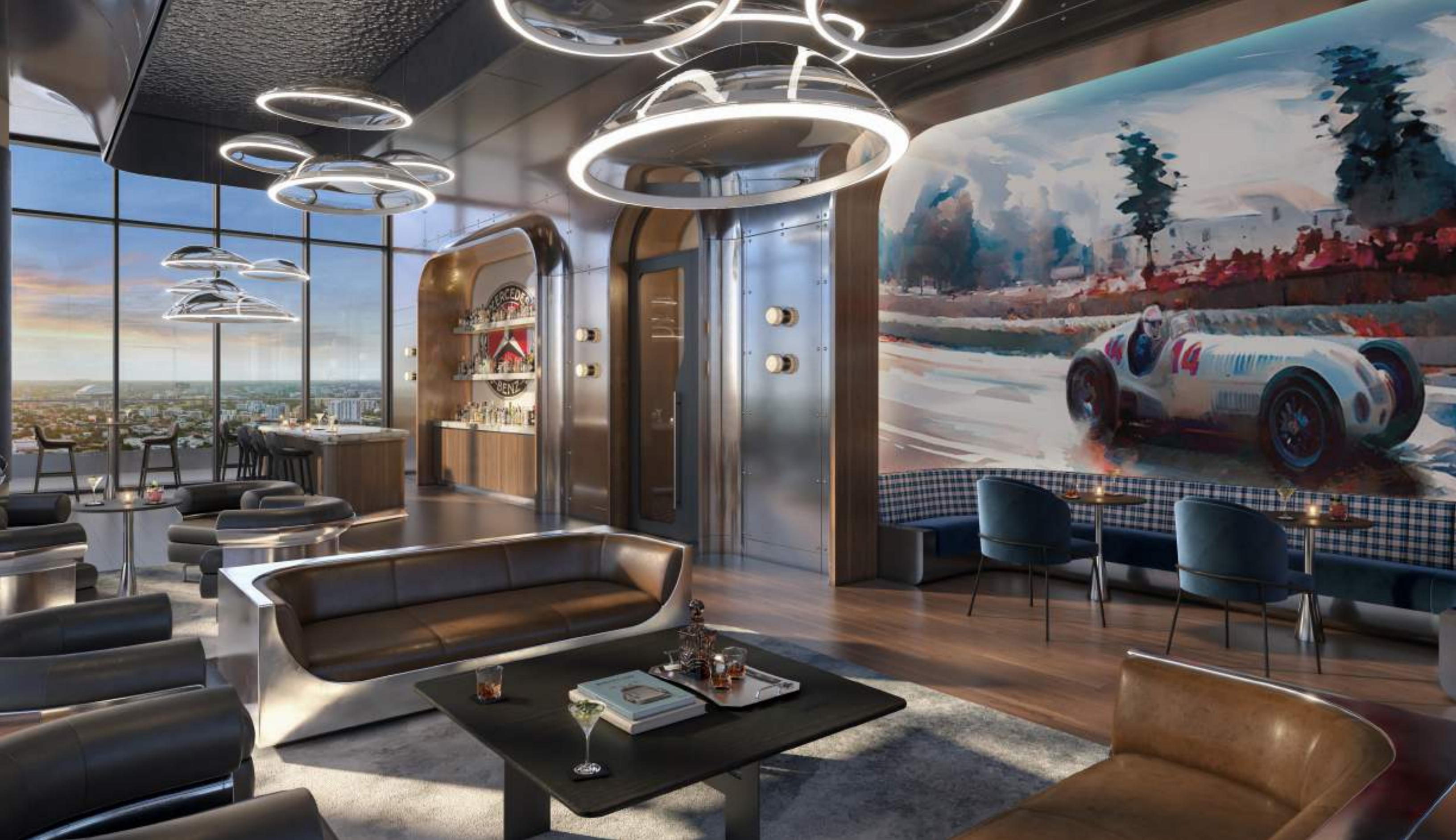
Silver Arrow Lounge