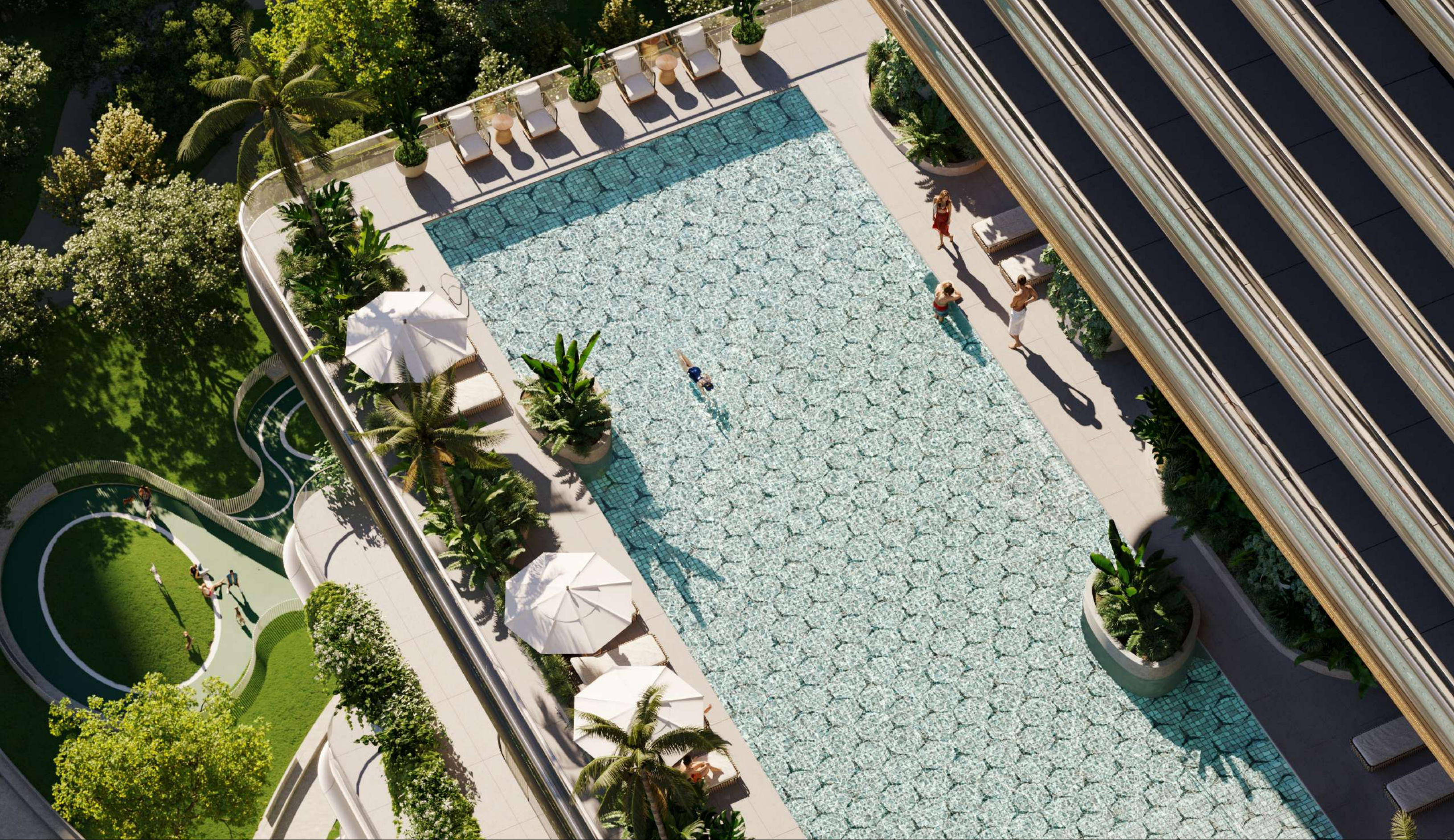
Sun Pool Deck