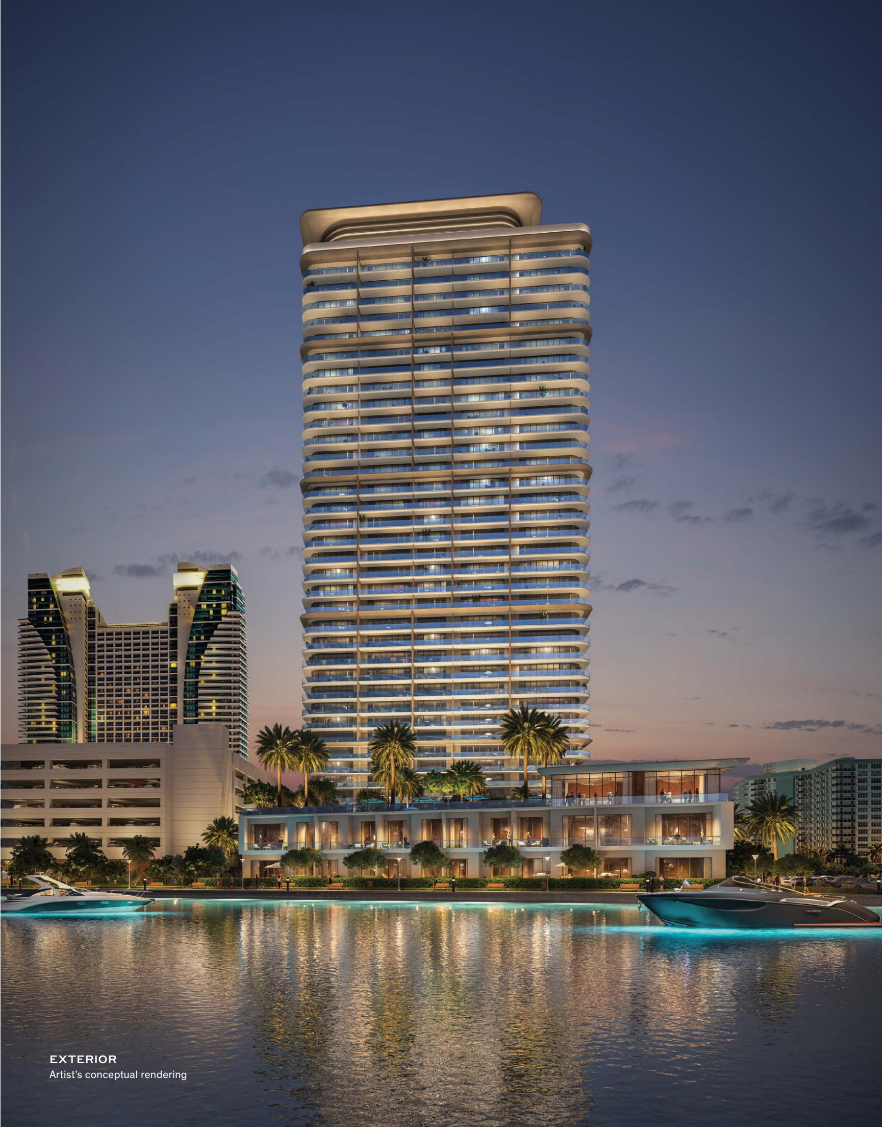
EXTERIOR Artist's conceptual rendering