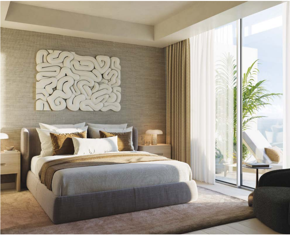
BEDROOM Artist's conceptual rendering

Interiors by Meyer Davis create a warm, minimalist aesthetic with clean, fluent lines, striking textures, and open, modern living spaces. The palette is distinctively soft and neutral, accentuated by rich coastal colors—a captivating blend of organic oceanfront beauty and streamlined custom design.