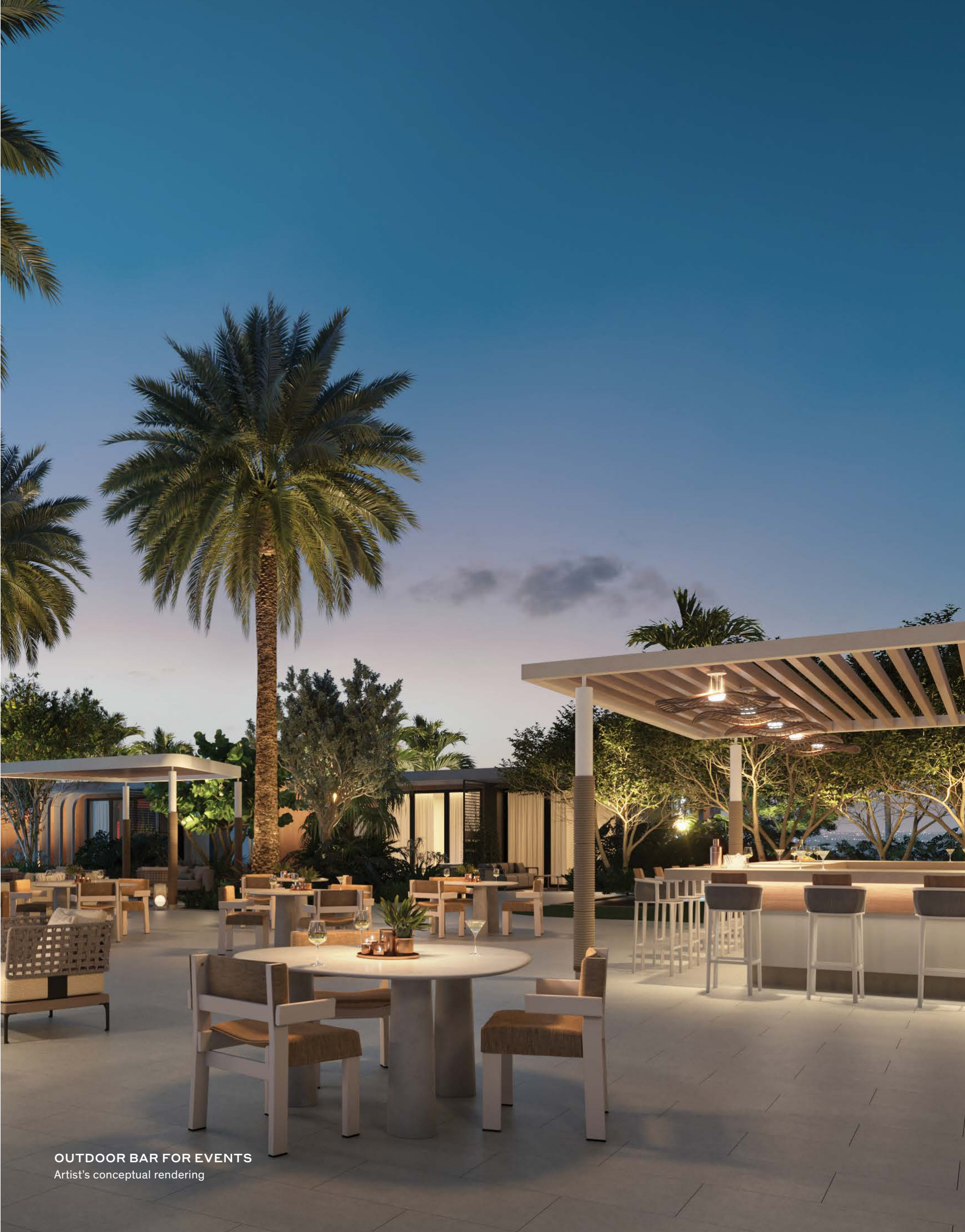
OUTDOOR BAR FOR EVENTS Artist's conceptual rendering