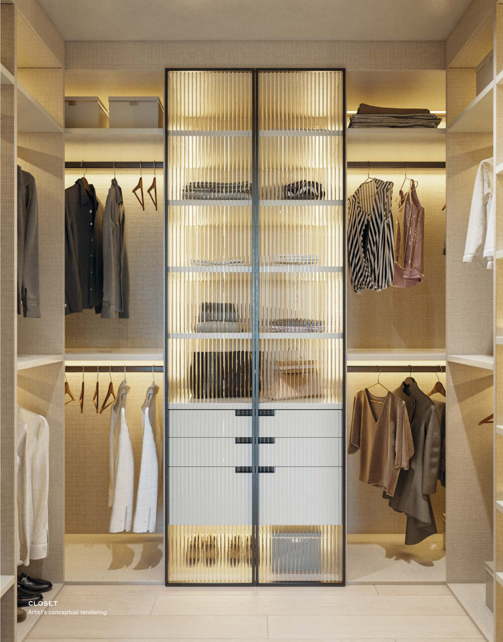
CLOSET Artist's conceptual rendering