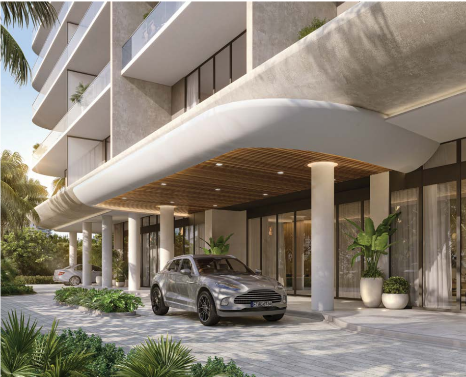
PORTE-COCHERE Artist's conceptual rendering

An expert concierge and management team are on hand to accommodate your requests, offer local guidance, and ensure that life at Icon Beach Residences feels effortless.