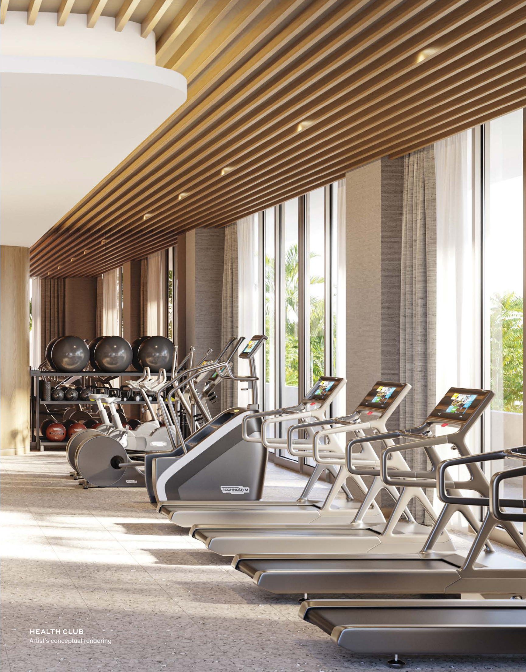
HEALTH CLUB Artist's conceptual rendering