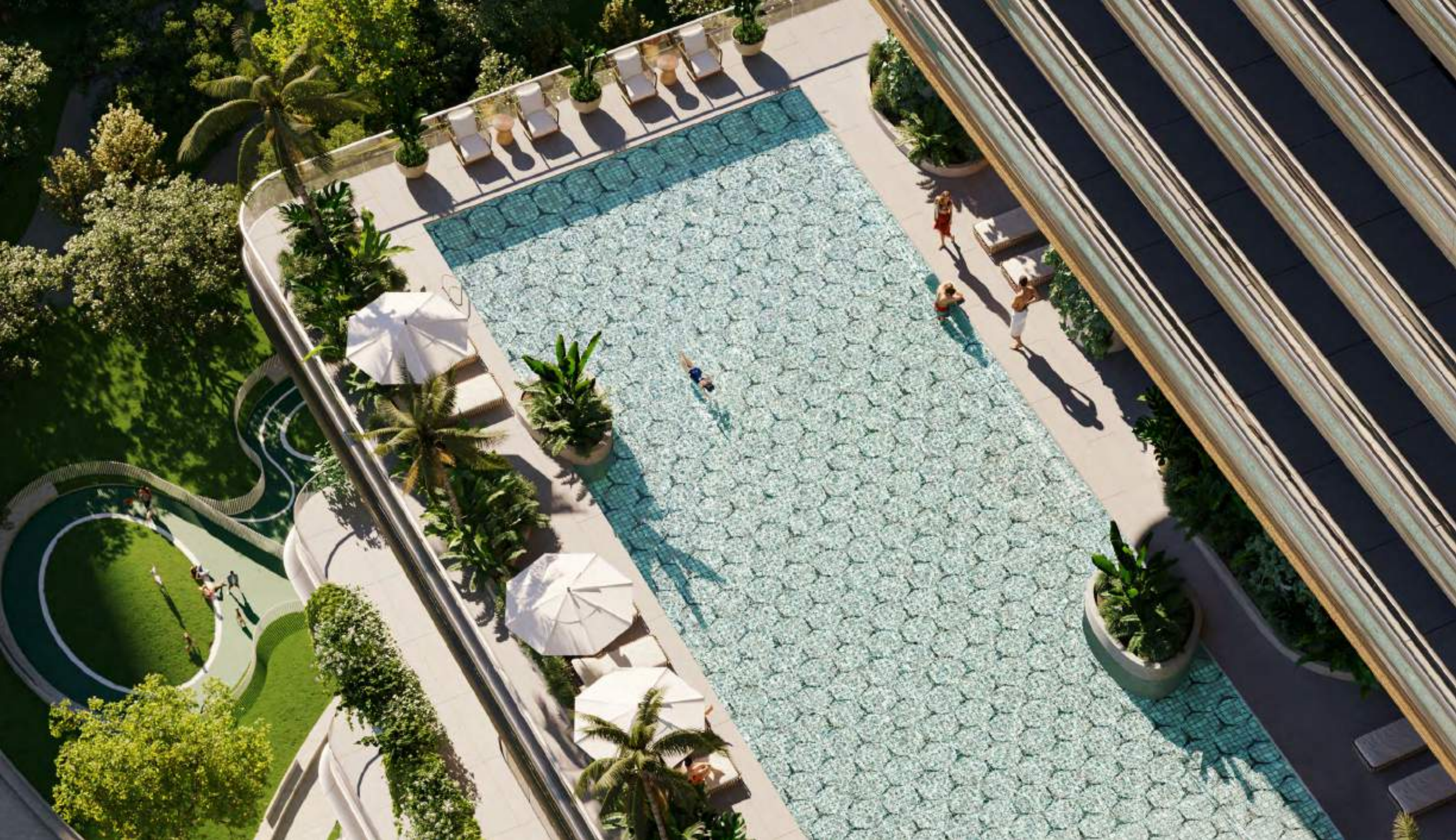
Sun Pool Deck