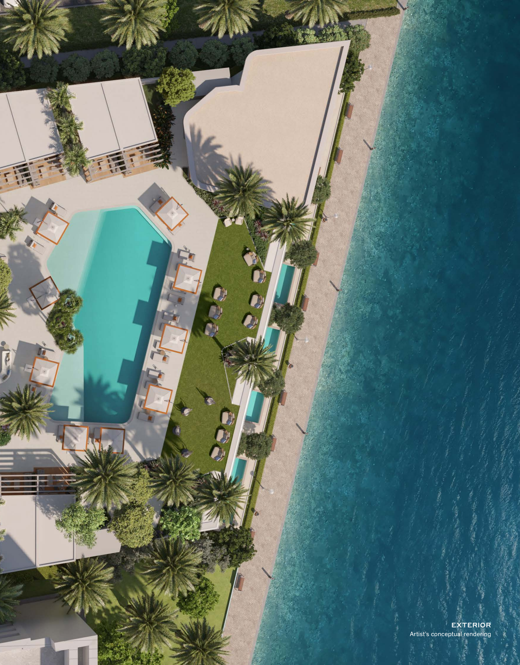
EXTERIOR Artist's conceptual rendering