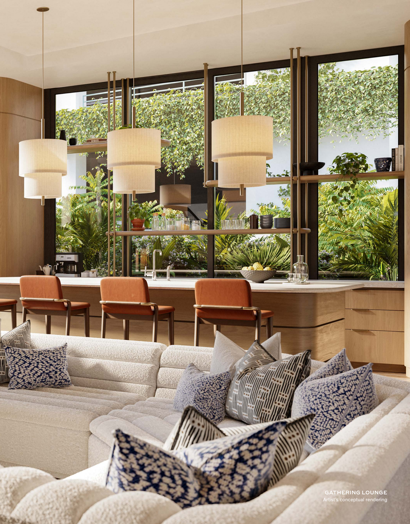
GATHERING LOUNGE Artist's conceptual rendering