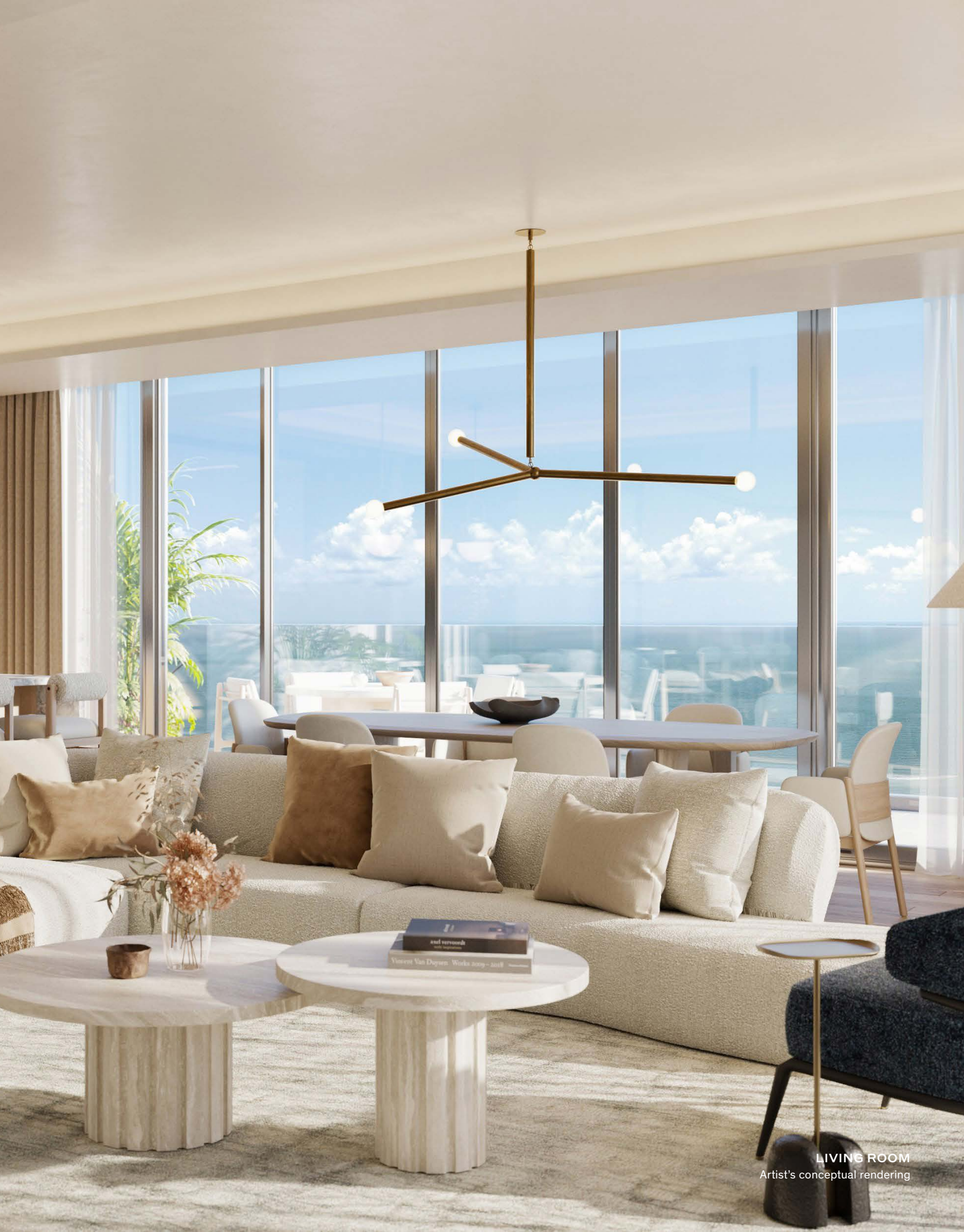
LIVING ROOM Artist's conceptual rendering