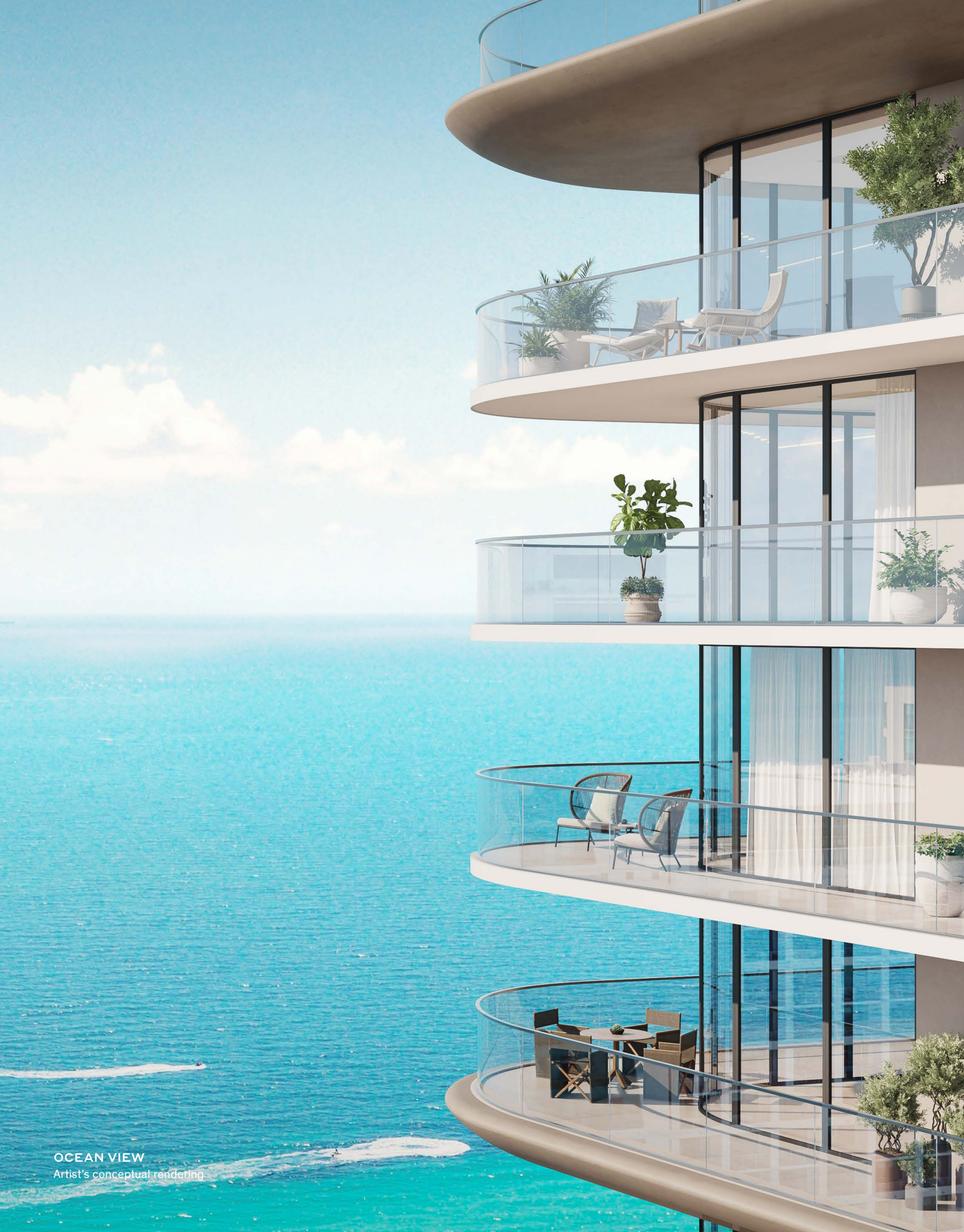
OCEAN VIEW Artist's conceptual rendering