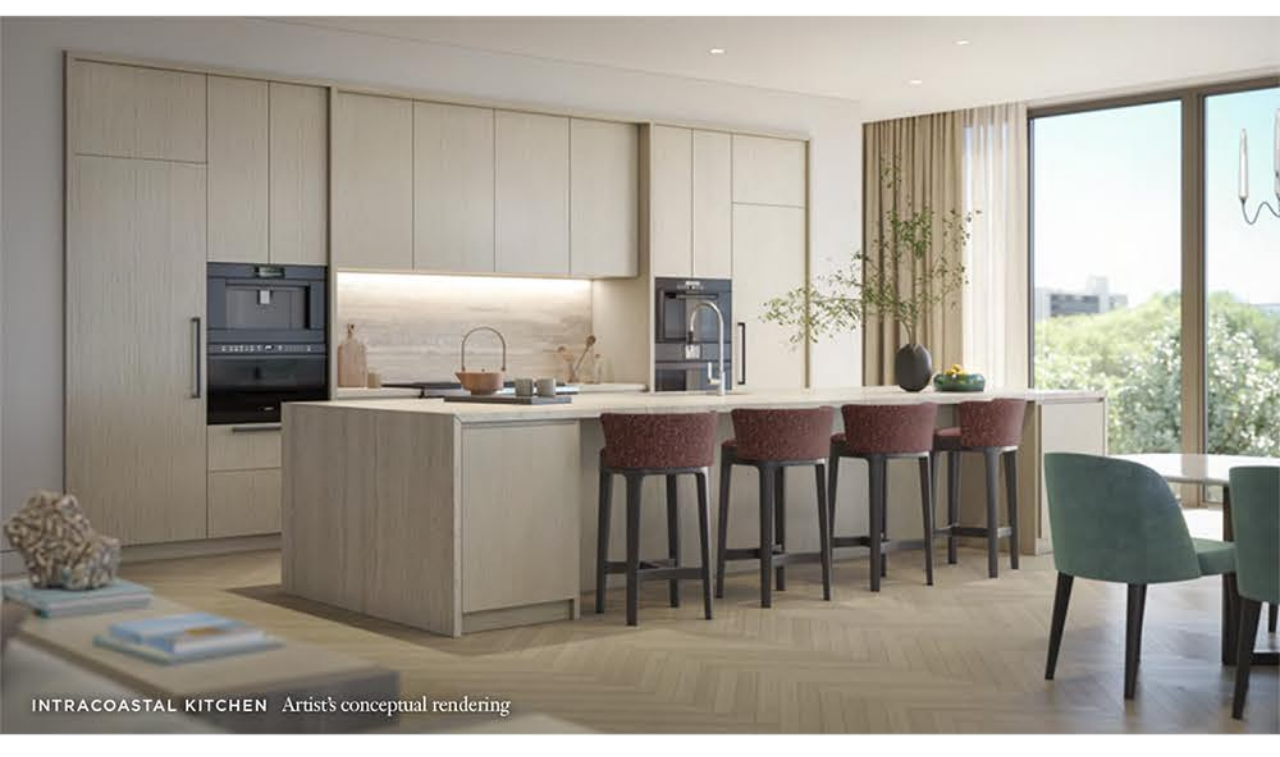
INTRACOASTAL KITCHEN Artist's conceptual rendering