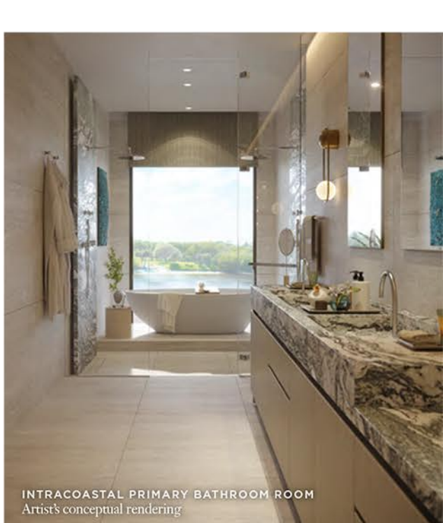
INTRACOASTAL PRIMARY BATHROOM ROOM Artist's conceptual rendering

Begin Your Next Chapter in Hillsboro Beach. Express Your Interest & Schedule a Presentation