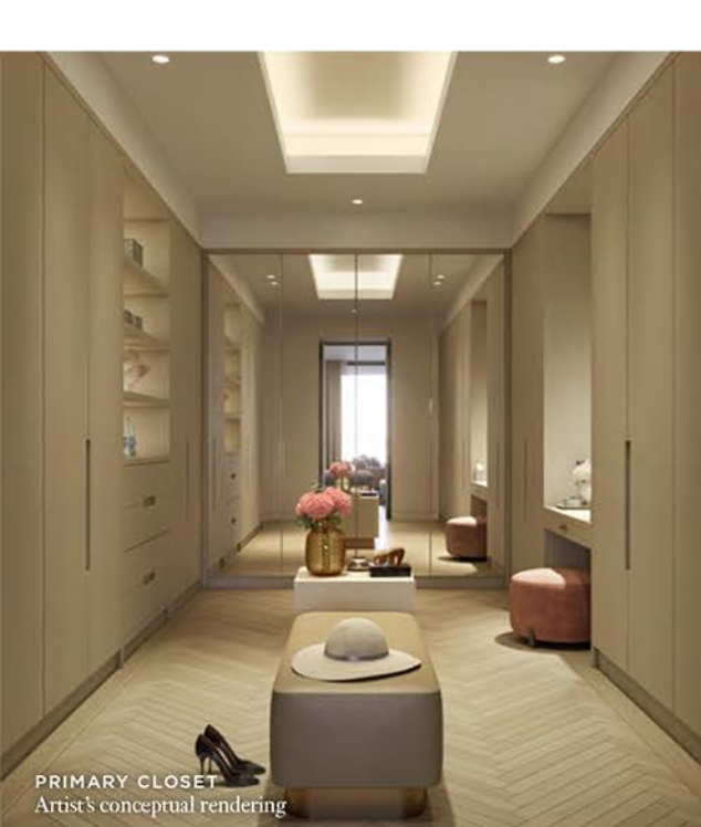
PRIMARY CLOSET Artist's conceptual rendering

From expansive oceanfront terraces to curated finishes, Rosewood Residences Hillsboro Beach is an exclusive waterfront enclave elevated by the timeless artistry of Rosewood.