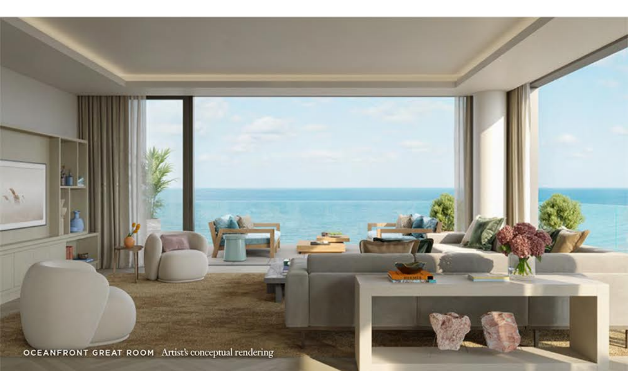
OCEANFRONT GREAT ROOM Artist's conceptual rendering

At Rosewood Residences Hillsboro Beach, every home reflects the serene beauty of its surroundings. Internationally acclaimed designer Piet Boon has crafted interiors that honor the natural elegance of Hillsboro Beach — weaving soft coastal palettes, organic textures, and refined details into a living experience defined by authenticity and sophistication.