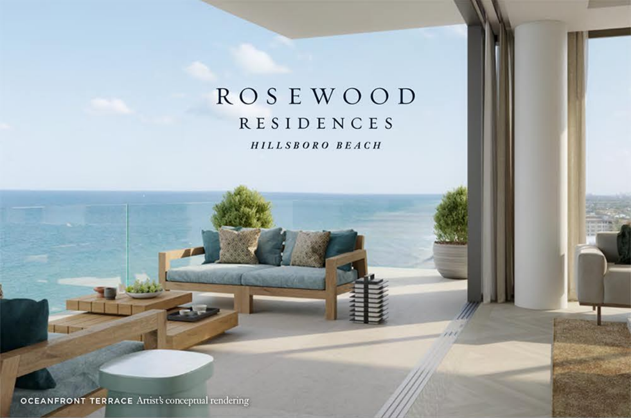
OCEANFRONT TERRACE Artist's conceptual rendering