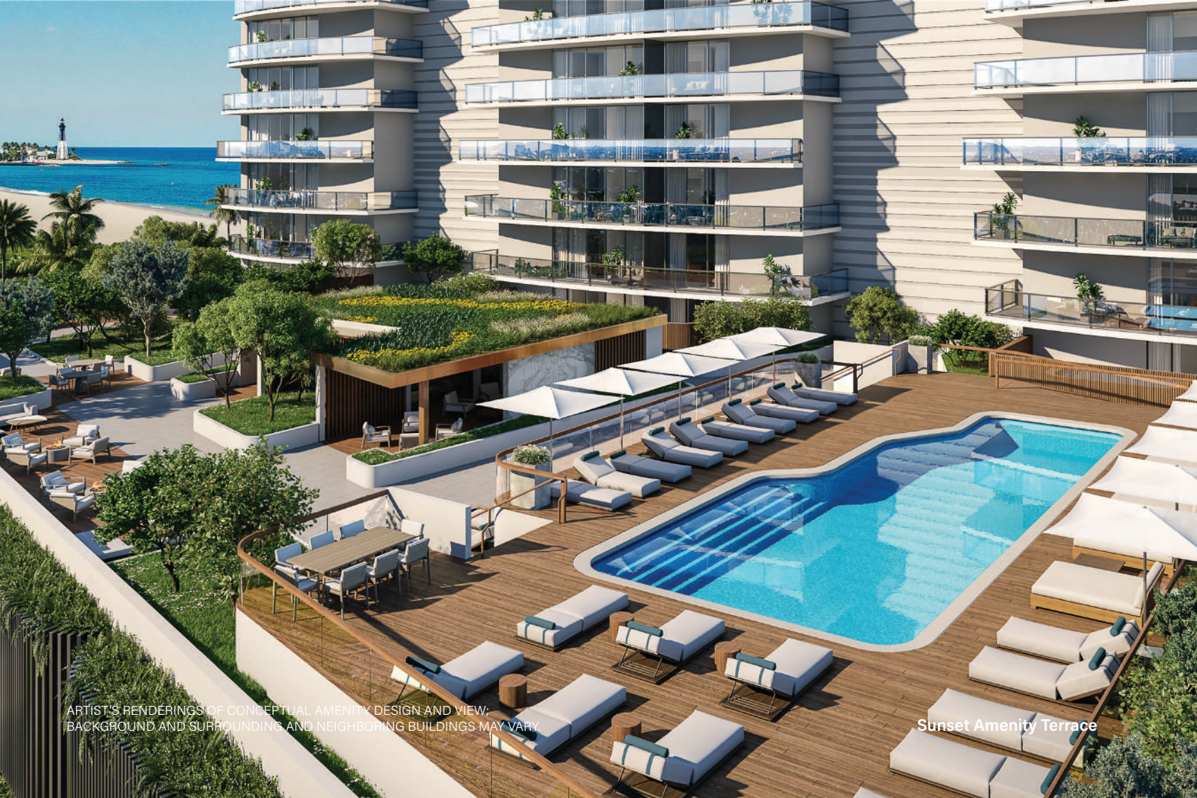
ARTIST'S RENDERINGS OF CONCEPTUAL AMENITY DESIGN AND VIEW; BACKGROUND AND SURROUNDING AND NEIGHBORING BUILDINGS MAY VARY.