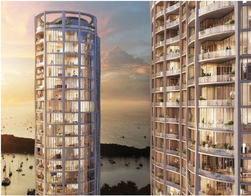
Park Grove, Coconut Grove, Florida