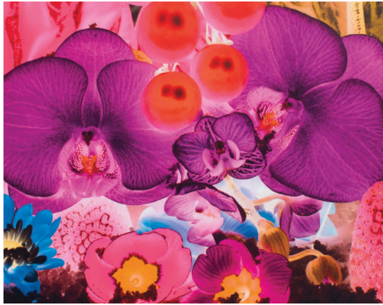
Marc Quinn (b. 1964, United Kingdom) At the Far Edges of the Universe, 2010. Seven digital pigment prints in colors. 27.5 x 41 inches each