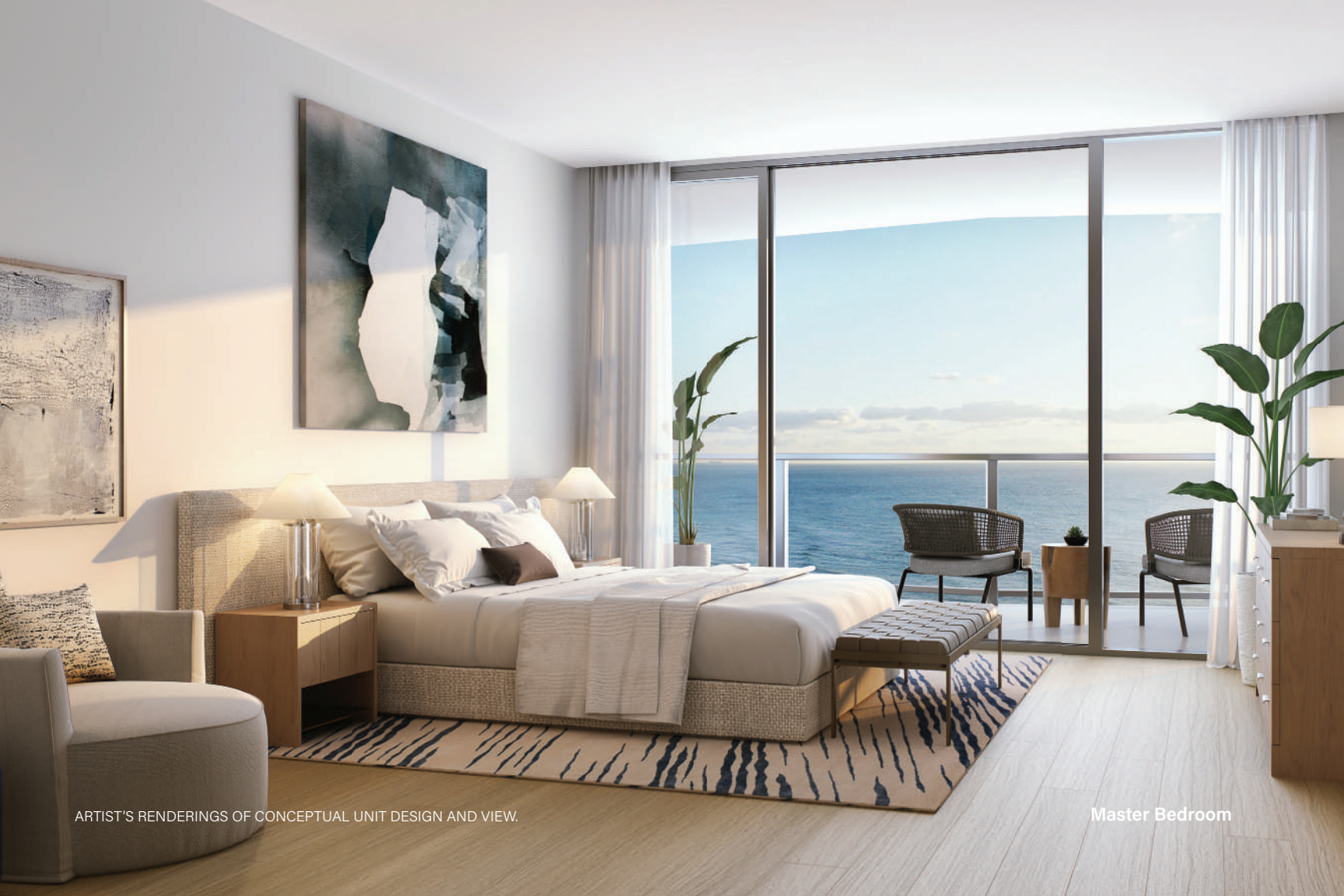
ARTIST'S RENDERINGS OF CONCEPTUAL UNIT DESIGN AND VIEW.