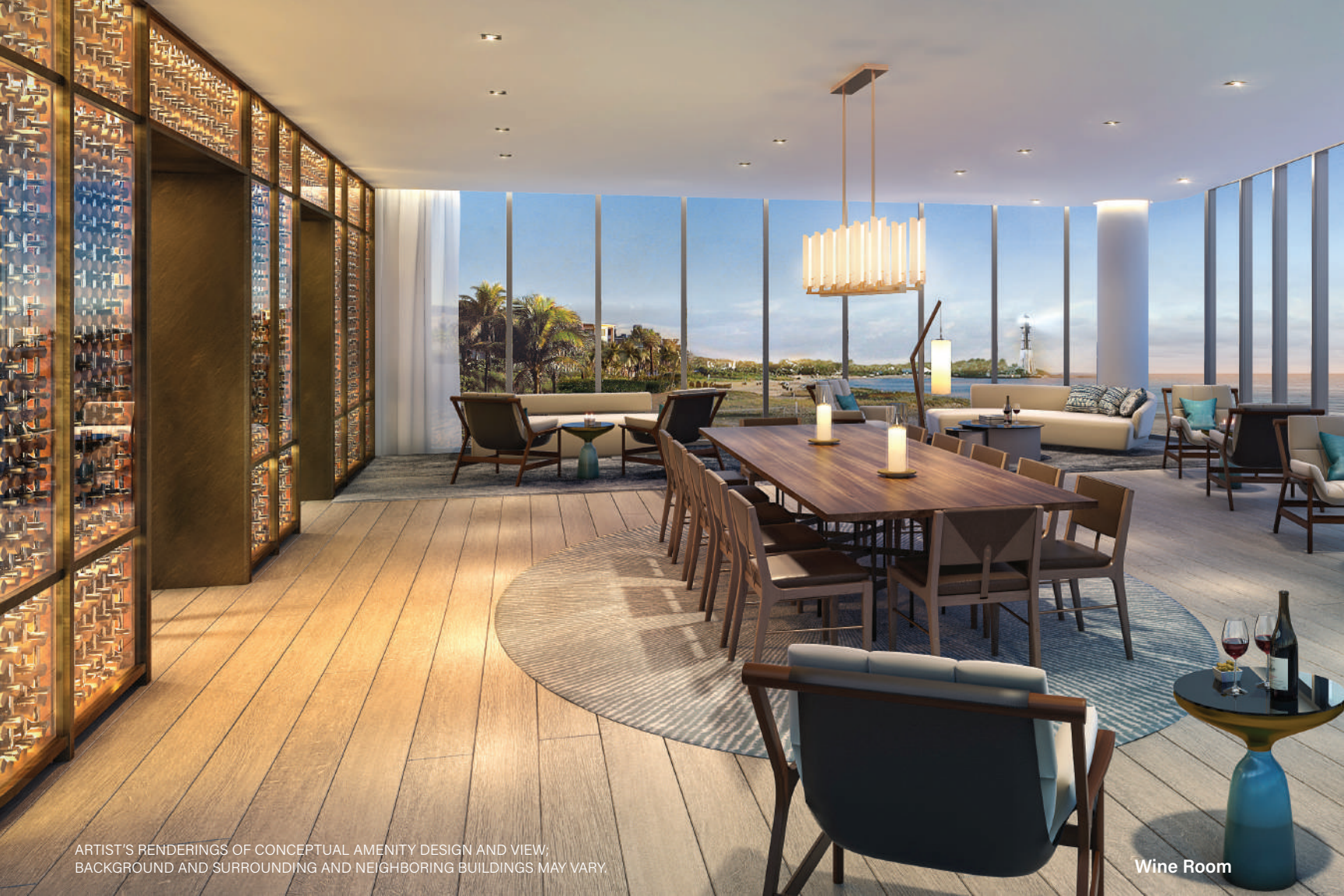
ARTIST'S RENDERINGS OF CONCEPTUAL AMENITY DESIGN AND VIEW; BACKGROUND AND SURROUNDING AND NEIGHBORING BUILDINGS MAY VARY.