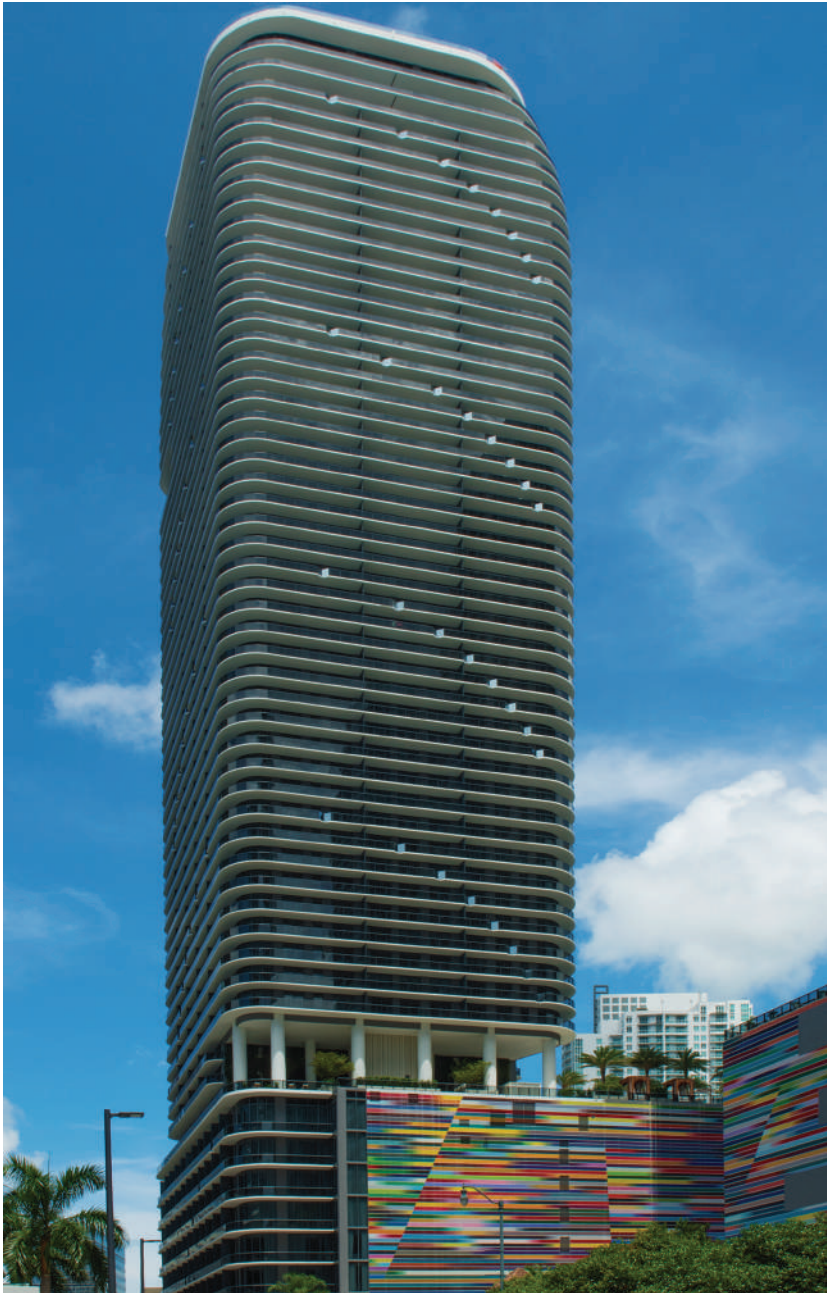
SLS Lux, Miami, Florida