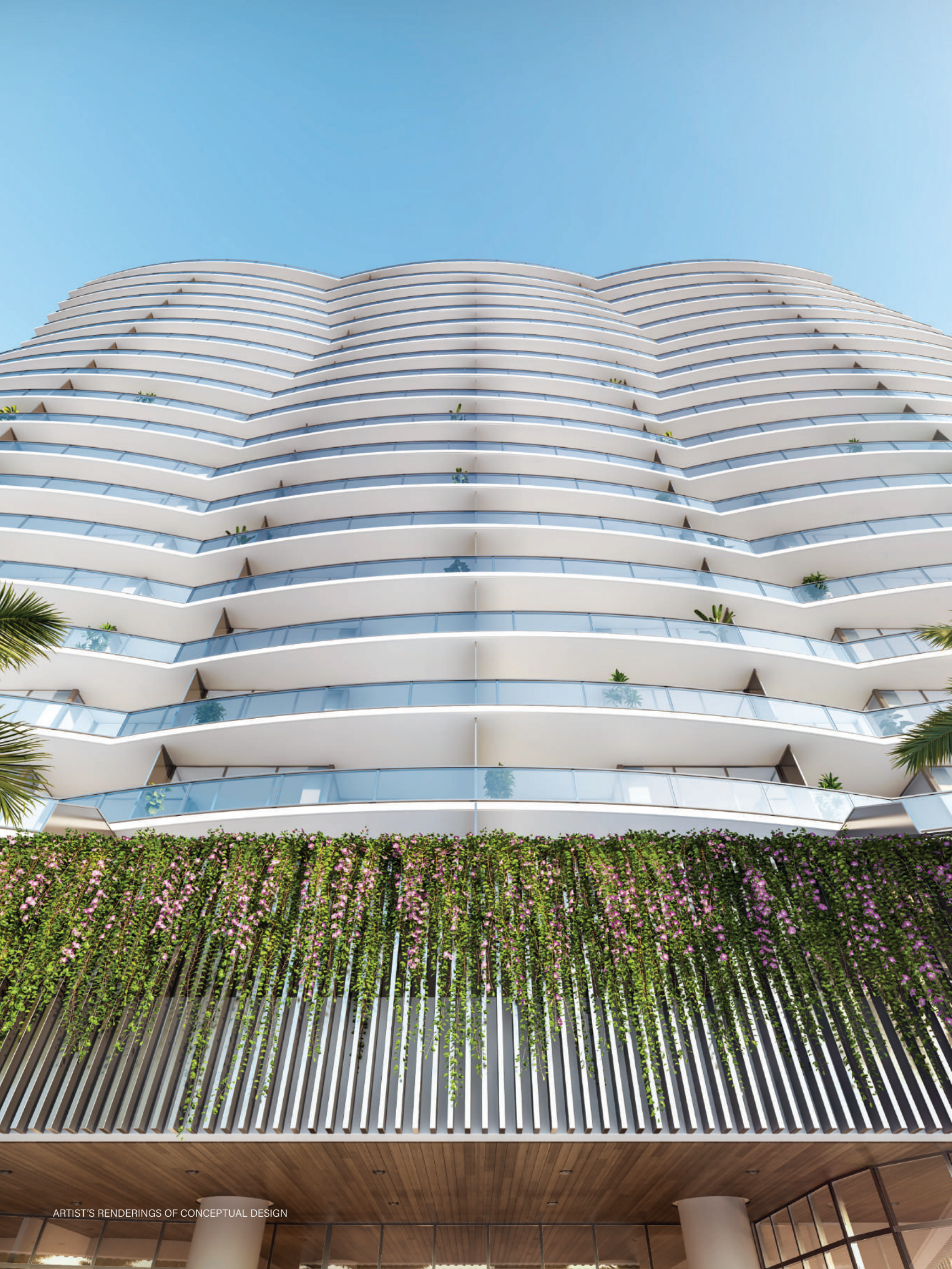
ARTIST'S RENDERINGS OF CONCEPTUAL DESIGN