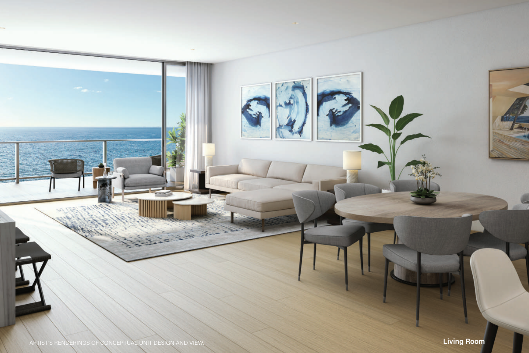
ARTIST'S RENDERINGS OF CONCEPTUAL UNIT DESIGN AND VIEW.