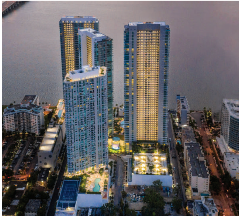
Paraiso District, Miami, Florida