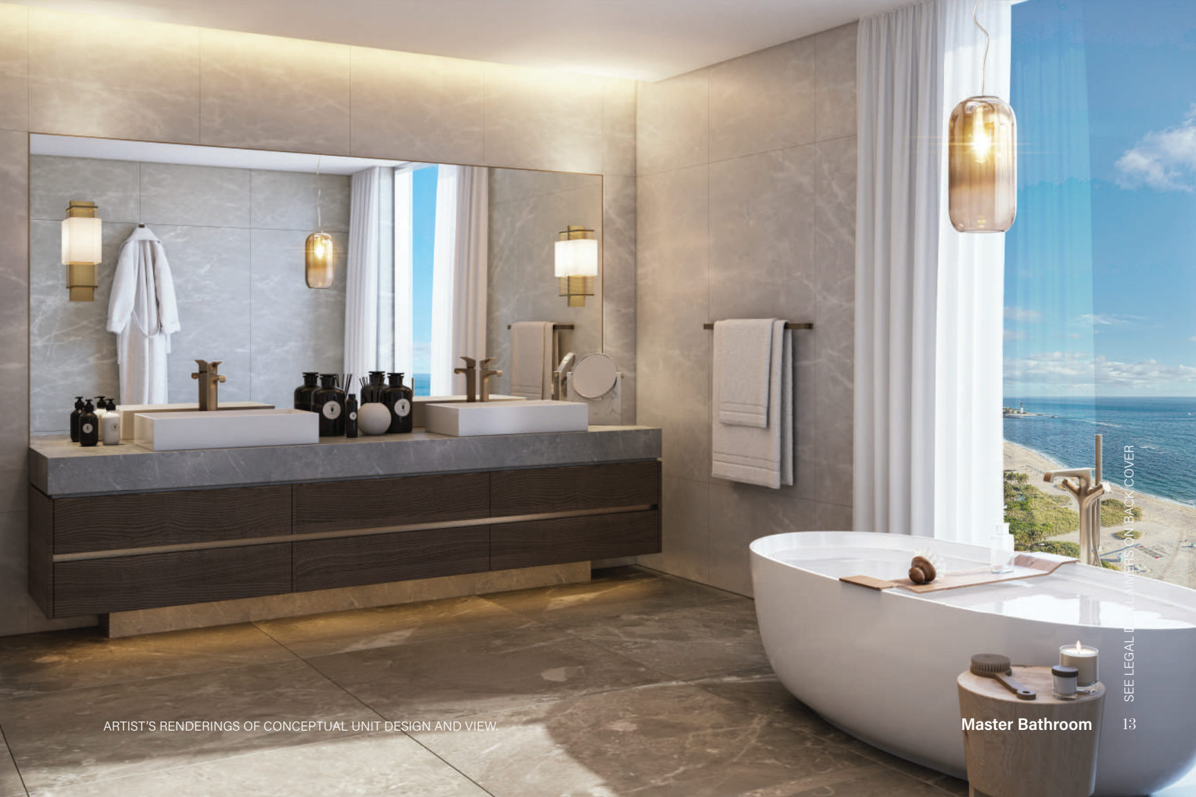
ARTIST'S RENDERINGS OF CONCEPTUAL UNIT DESIGN AND VIEW.