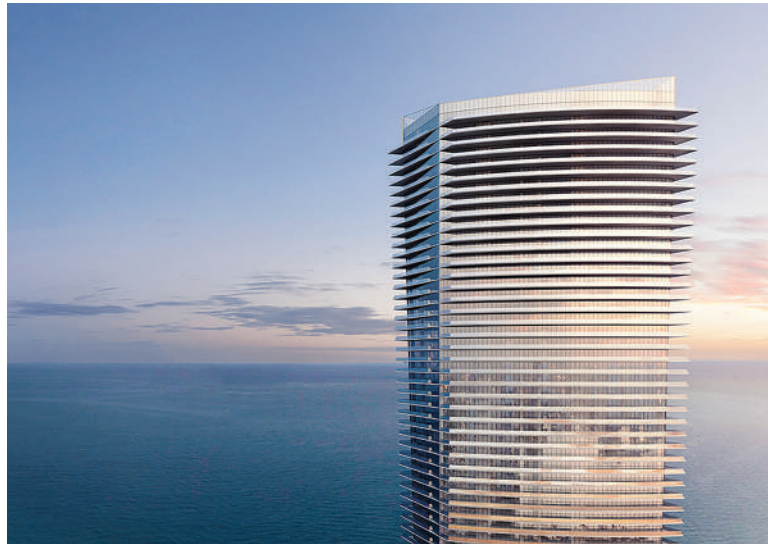
Residences by Armani Casa, Sunny Isles Beach, Florida