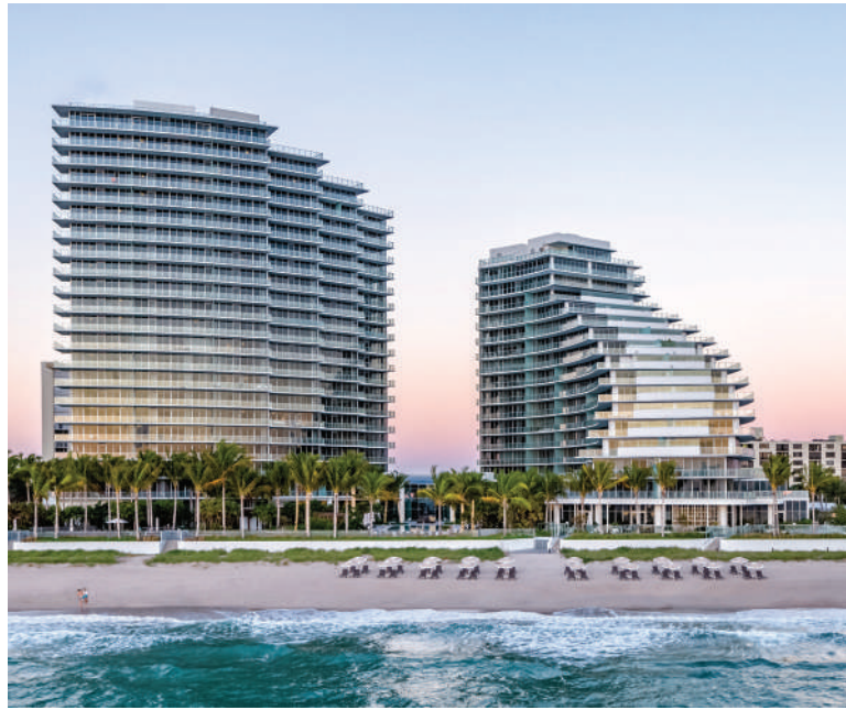
Auberge Beach Residences & Spa, Fort Lauderdale, Florida