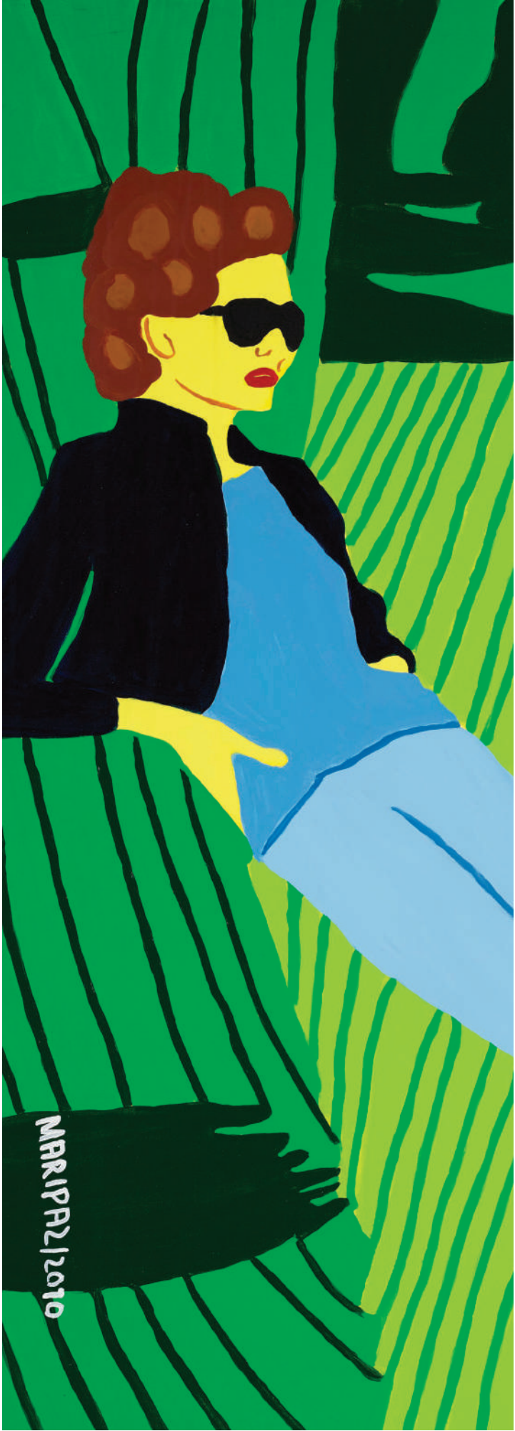
Maripaz Jaramillo (María de la Paz, b. 1948, Colombia) Ellas, 2010. Acrylic on canvas. 47 1/5 x 23 3/5 inches