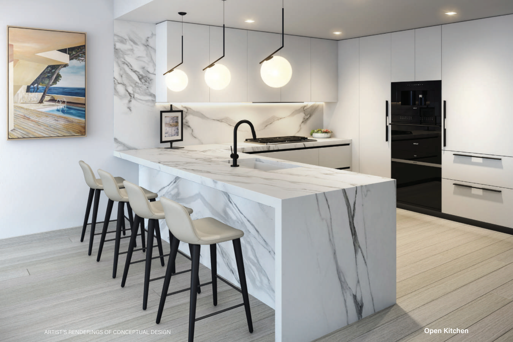
ARTIST'S RENDERINGS OF CONCEPTUAL DESIGN