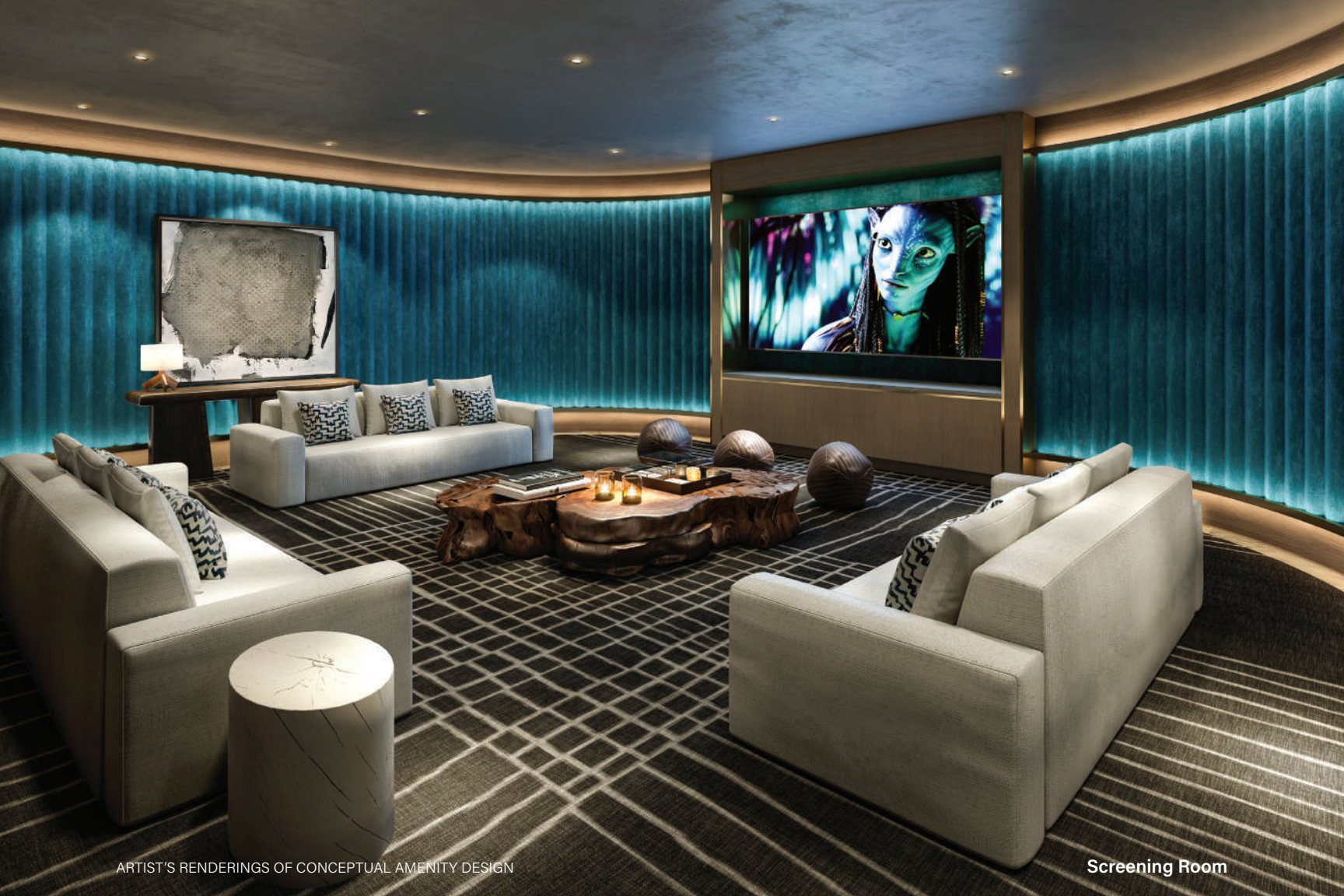
ARTIST'S RENDERINGS OF CONCEPTUAL AMENITY DESIGN