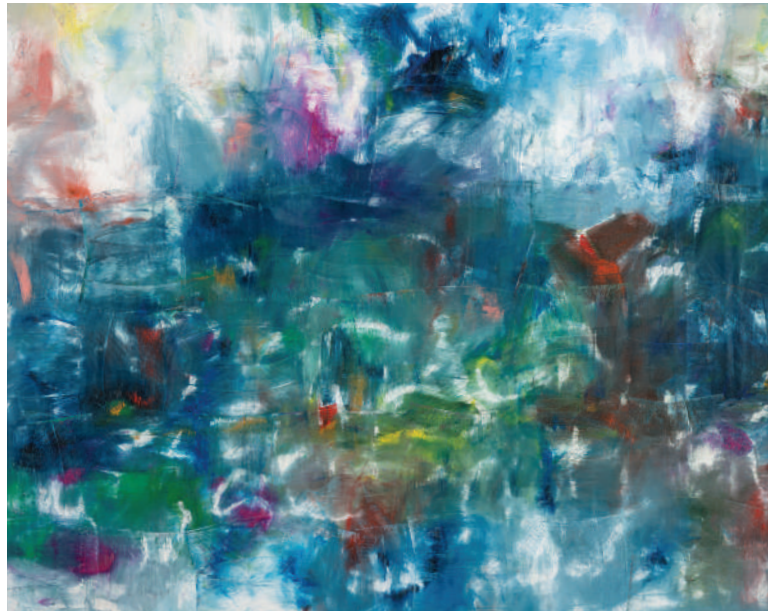
Dan Rees (b. 1982, United Kingdom) Artex Painting, 2013. Oil on canvas. 119 x 159 inches