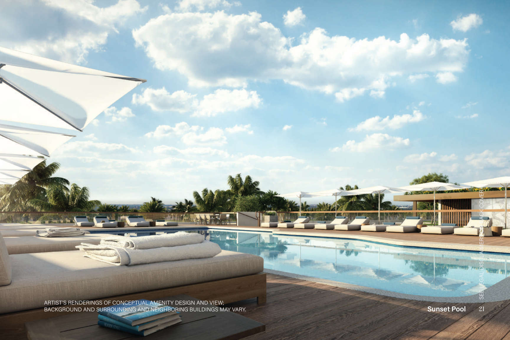
ARTIST'S RENDERINGS OF CONCEPTUAL AMENITY DESIGN AND VIEW; BACKGROUND AND SURROUNDING AND NEIGHBORING BUILDINGS MAY VARY.