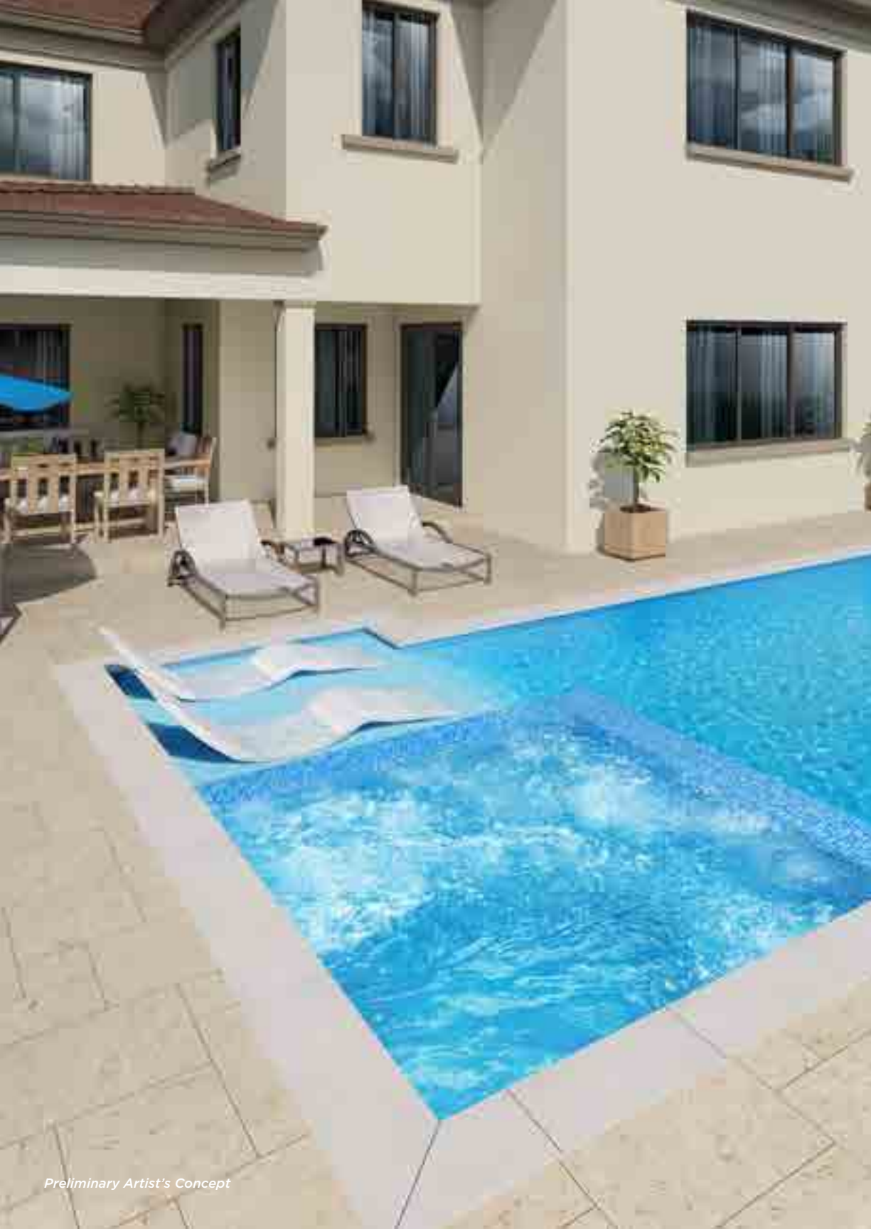
Preliminary Artist's Concept