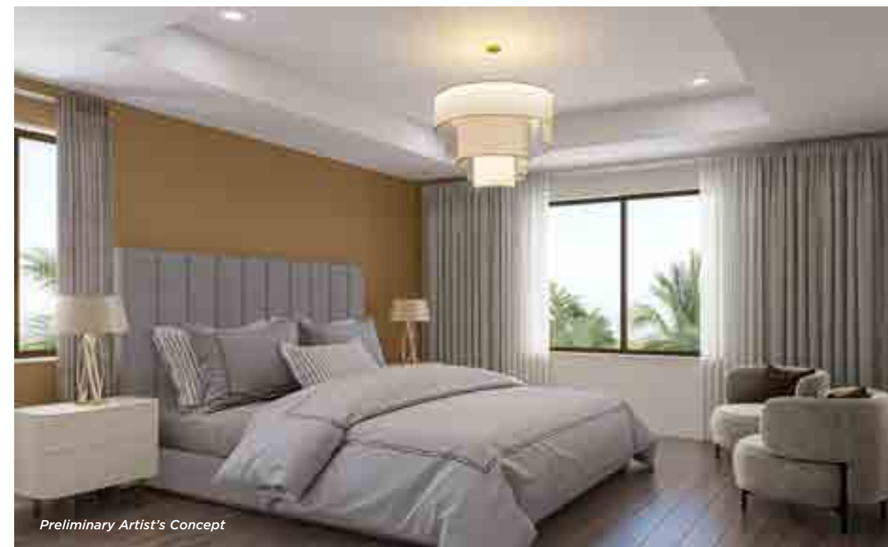
Preliminary Artist's Concept