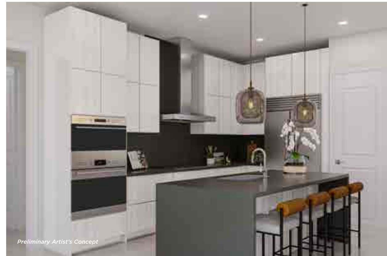
Preliminary Artist's Concept