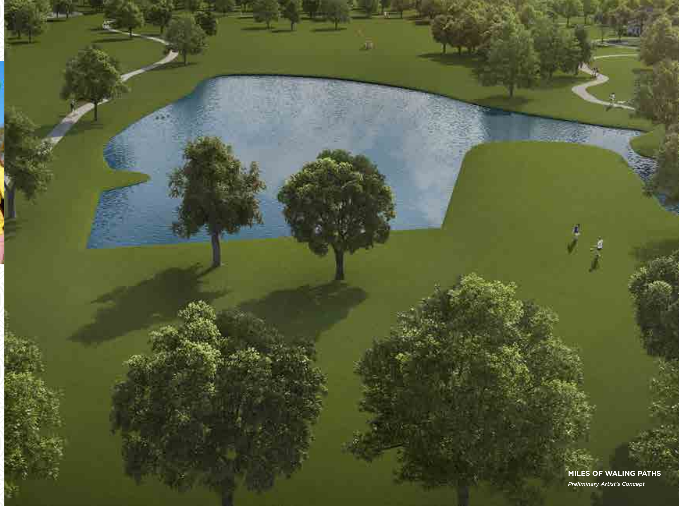
MILES OF WALING PATHS Preliminary Artist's Concept

Greenview at Presidential will offer an exceptional array of amenities designed to delight residents of all ages and lifestyles. Soak up the Florida sunshine at the resort-style pool, gather with friends for a celebration in the stylishly appointed Clubhouse, let the kids play with their new friends at the lively tot lot, get in shape in the state-of-the-art fitness center or immerse yourself in the serene beauty of nature along picturesque walking paths and tranquil lake vistas.