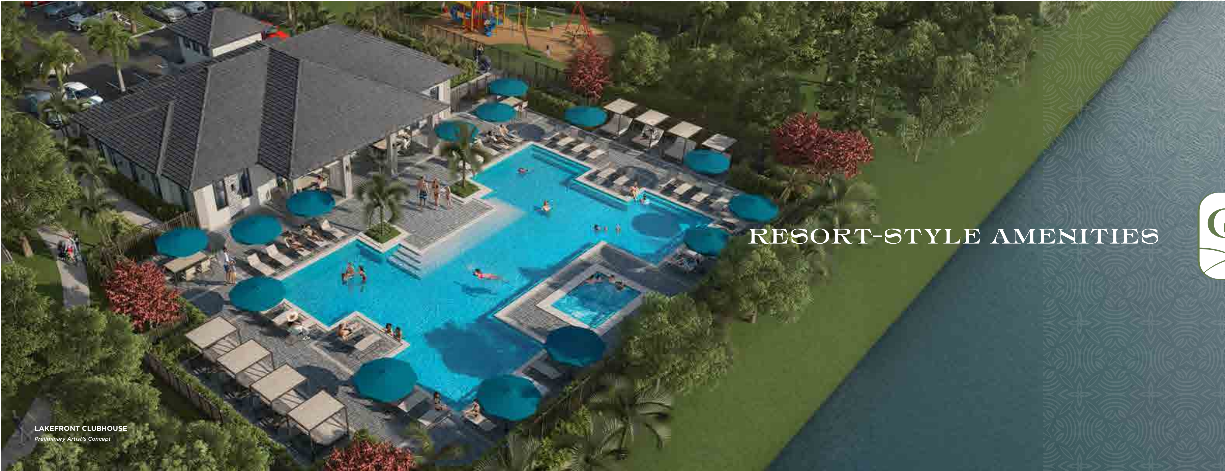
LAKEFRONT CLUBHOUSE Preliminary Artist's Concept