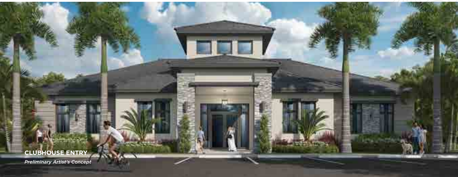
CLUBHOUSE ENTRY Preliminary Artist's Concept