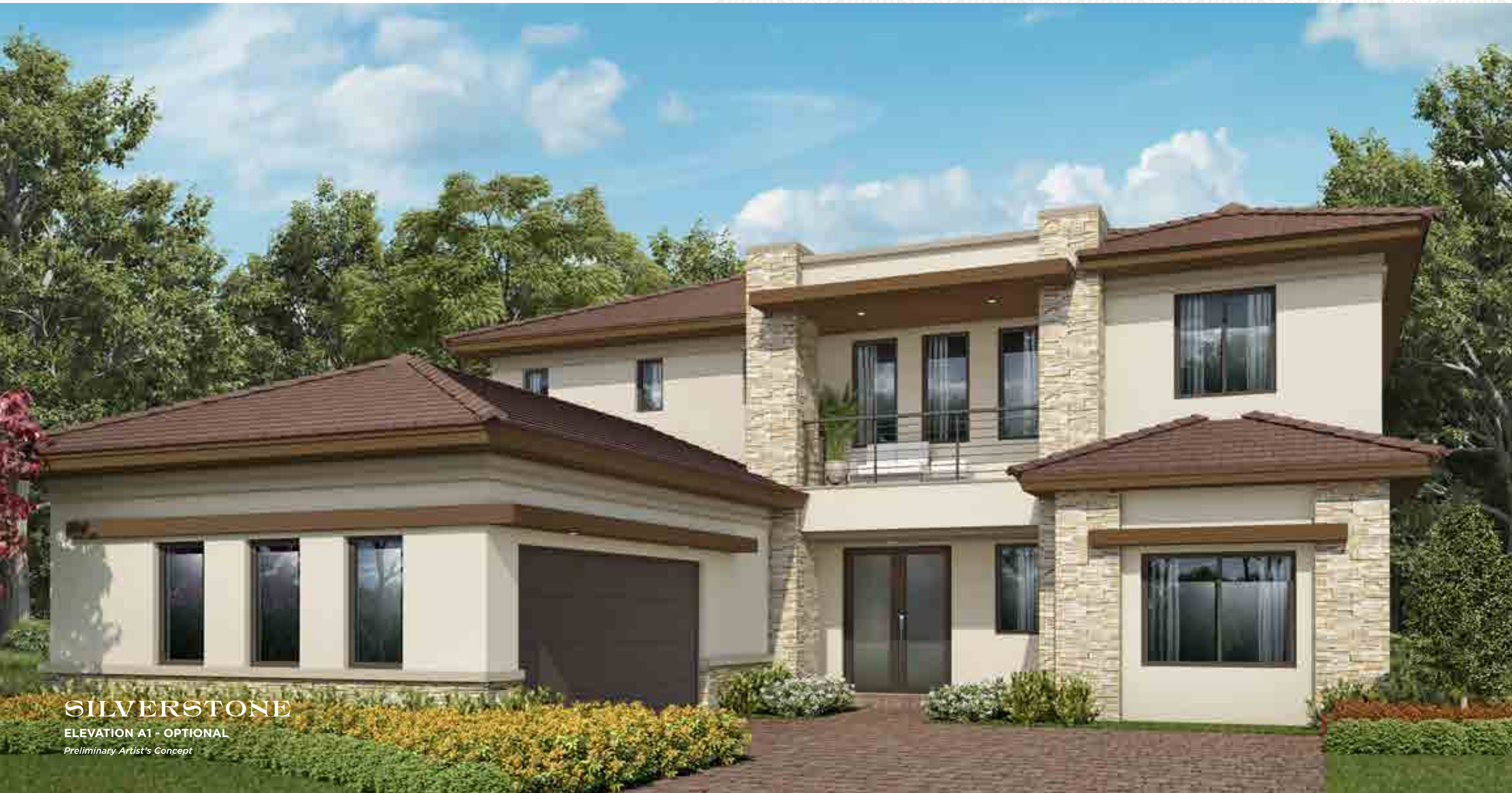
SILVERSTONE ELEVATION A1 - OPTIONAL Preliminary Artist's Concept